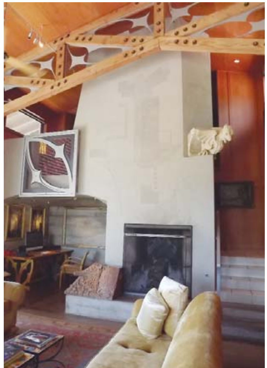
A blueprint of Rancho Diablo was etched into the fireplace flu in the living room.

Where the old wood is heavy and dark, she brought in heavy but light colored wood in the new wings; where there was brick, the new wings feature rough stucco. Light fir in wide strips echo the board and batten wall covering in the old house section.