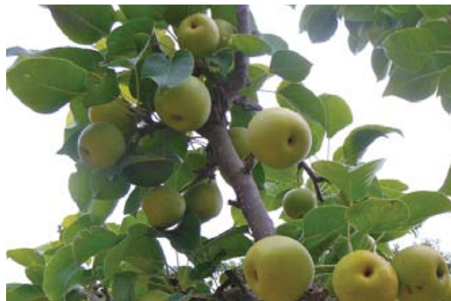
Delicious Asian pears are a favorite fruit of deer and humans.

On the sixth night, I positioned wooden pallets and garbage cans around the perimeter to discourage his high jump. He's an Olympian.