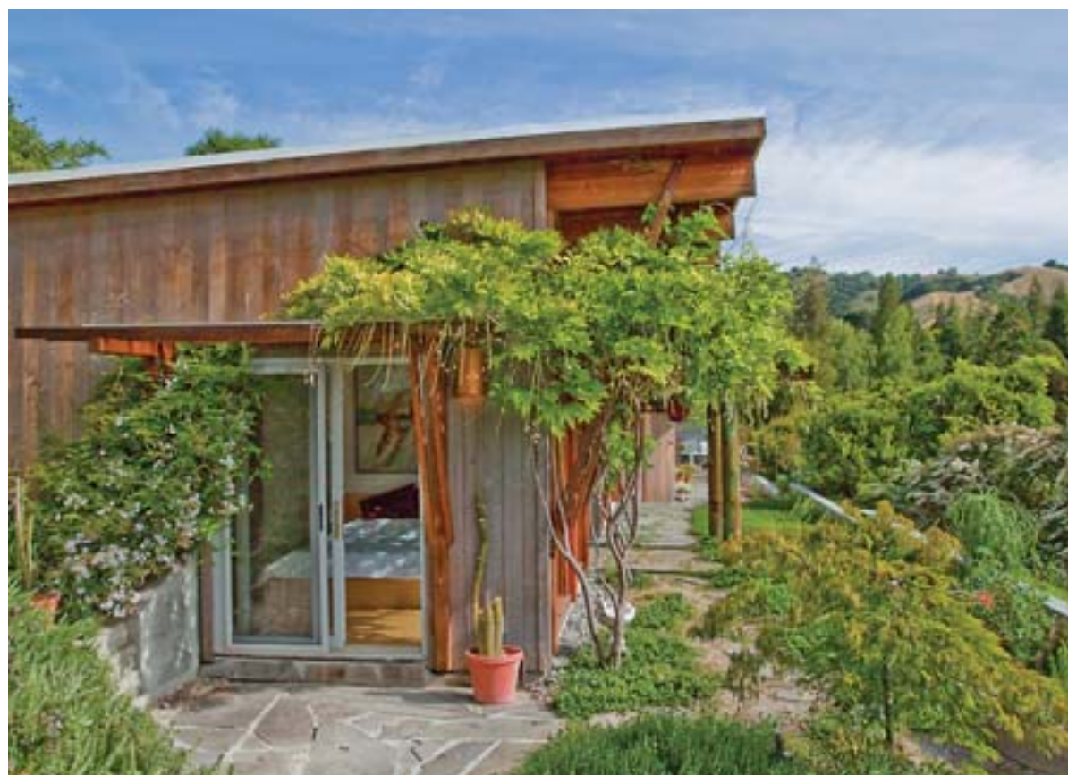
The bedroom gets morning sun through its west and south-facing windows, and shade from the protruding wisteria vines.

To purchase tickets ($40 in advance; $50 day-of) visit http://tinyurl.com/jvqzd6v and click on “register now.”