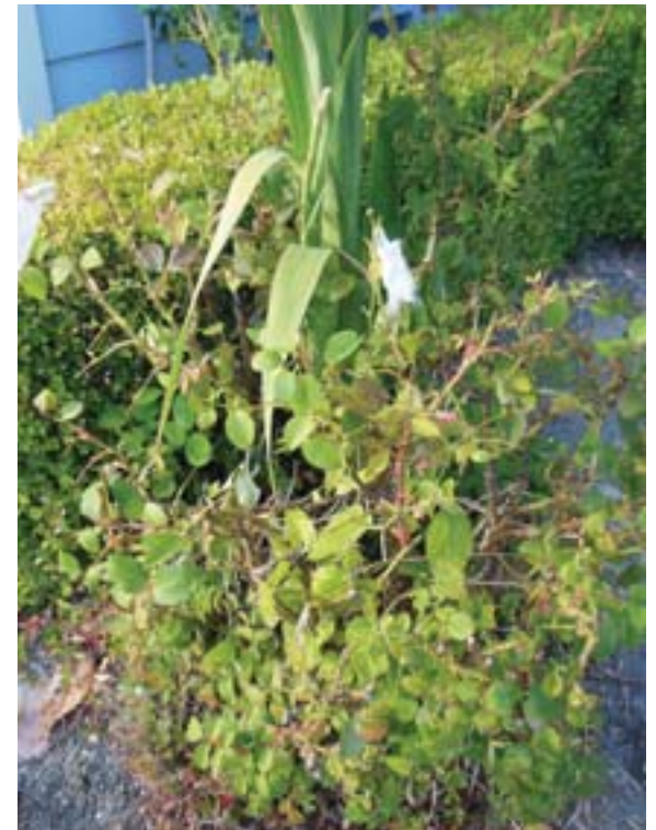
The same rose bush after the deer's munching spree. Notice the dryer sheet of Bounce stuck to the stem.