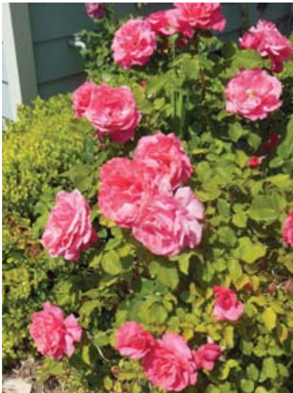
Cynthia's rose bush before the buck jumped the fence.