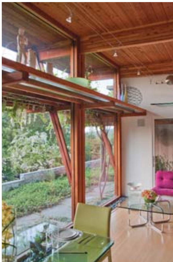
Bringing the outside trellis indoors creates a built-in ledge to display some of the owner's art collection.