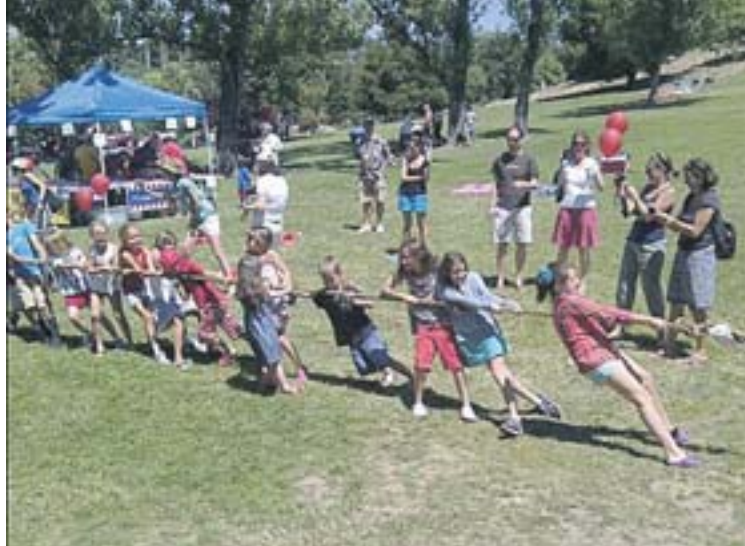
Local kids join in a hearty game of tug of war at the Moraga Commons.