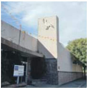
Phair building on Avenida de Orinda

During an over five-hour meeting Aug. 13, the Orinda Planning Commission weighed in on two design review applications for new homes before its public hearing of the proposal by Fountainhead Montessori to transform the historic, but long vacant Phair's store in the Orinda Village.