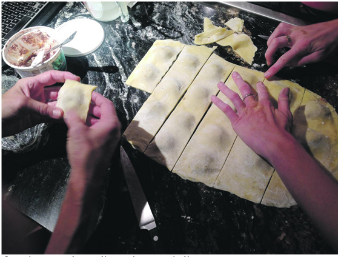
Cutting and sealing the raviolis