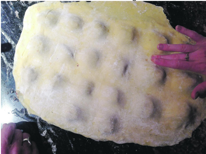
Dough with filling and top layer of dough