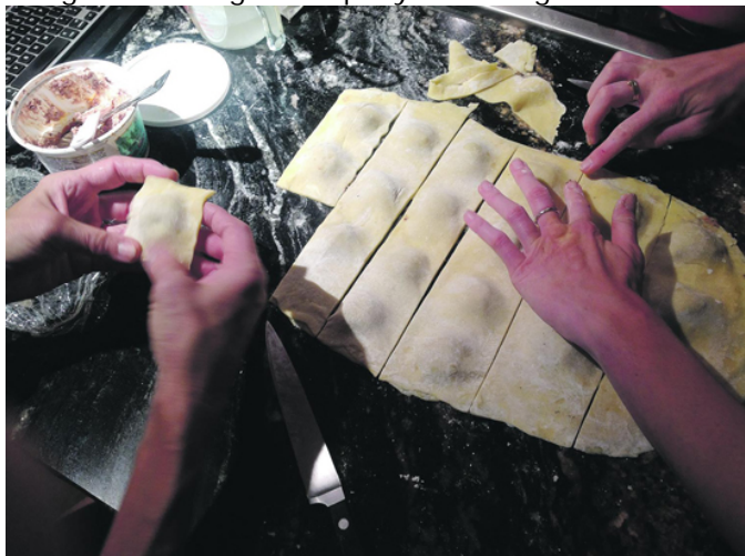
Cutting and sealing the raviolis Pasta