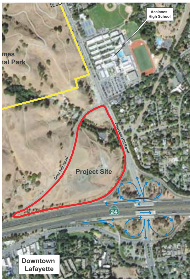
Context map. Source: Google Earth Pro, 2011. Map from city staff report

In addition, they proposed several transportation related improvements: a dedicated place to drop off students, improved sidewalks, and installing a class II bike lane that buffers cyclists with a strip of landscaping between them and motorists zipping by. The city concluded that traffic is a significant impact that is difficult to mitigate, said Steve Abrams of