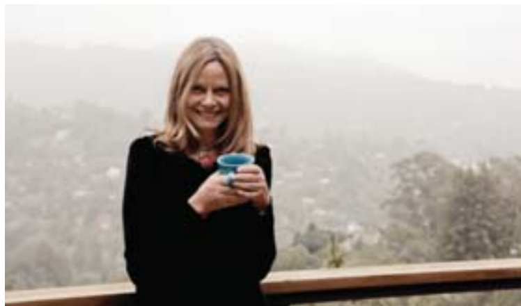
Author Joyce Maynard