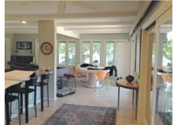
Before – low slung beams, dated tile and a choppy floor plan work against the views.

The best part about this project was my clients – this couple has charisma, and not a small amount of knowledge of design. Rarely, do I get the opportunity to discuss the likes of Stark, Miller, Nelson and Wormley with clients who can hold their own.