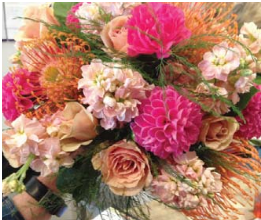
Don't be afraid of color. Orange protea complements the neon pink dahlias, peach roses, and pink stock with wisps of asparagus ferns.