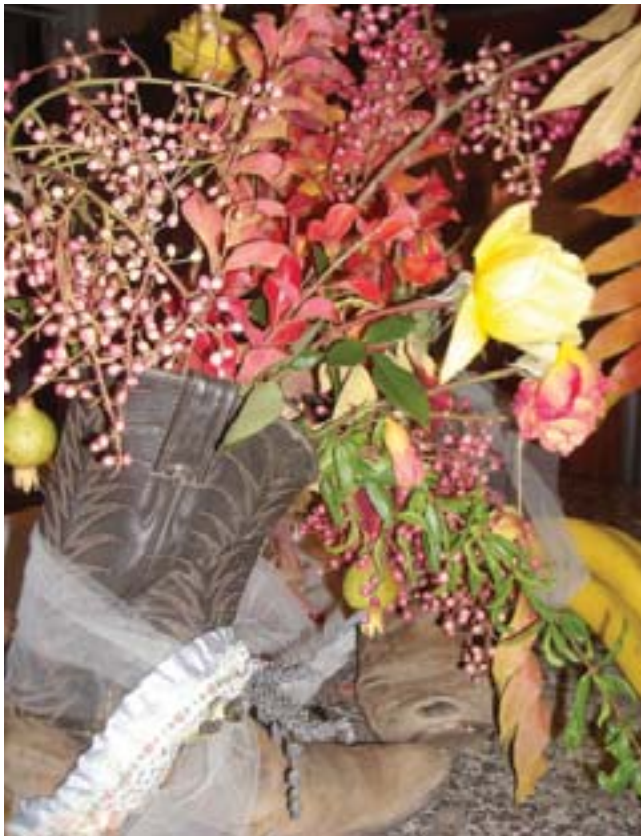
A country feel using well worn cowboy boots filled with pistache berries, roses, baby pomegranates, and amber crepe myrtles.