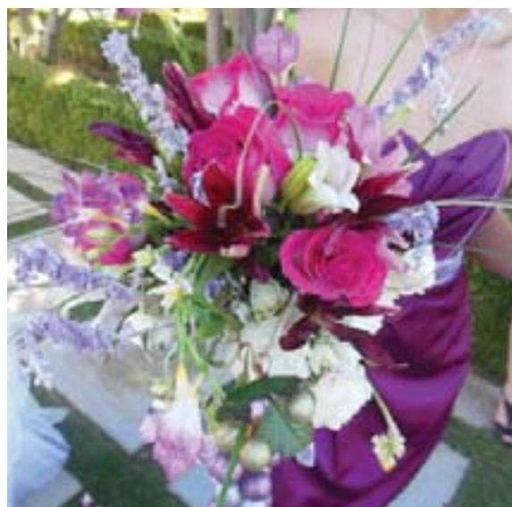
A beautiful bridesmaid bouquet of loosely arranged and hand-tied magenta lilies, stargazer lilies, fuchsia colored roses, Russian sage, narcissus, freesia, and bear grass are adorned with a grape cluster.

Choose a color scheme. Do you want a boisterous mix or monochromatic spray? Depending on the occasion and the final location placement, the arrangement can be tall, low, rambling, cascading, lush, simple, or fancy. For best results, allow flower stems to soak for 24 hours in 8 to 10 inches of water after cutting before creating your masterpiece.