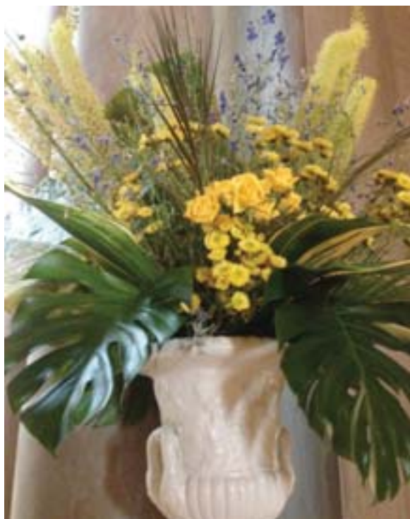
Big leafed plants such as philodendron add drama to an urn when combined with roses, palm fronds, feathery plumes, and splashes of color.

To be successful, use innovative combinations of foliage, flowers, and wispy elements. Fruit, vegetables, herbs, succulents, and even weeds add appeal to displays. Urns, bottles, flutes, boots, pitchers, or any vessel that holds water can become an attractive base vase.