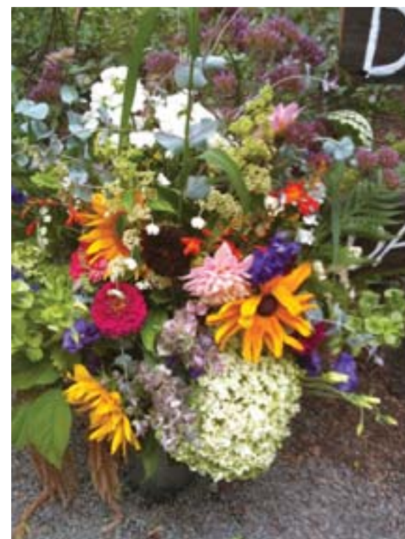
A lovely loose mixture of the best of fall flowers including dahlia, zinnia, hydrangea, allium, eucalyptus leaves, and agastache.