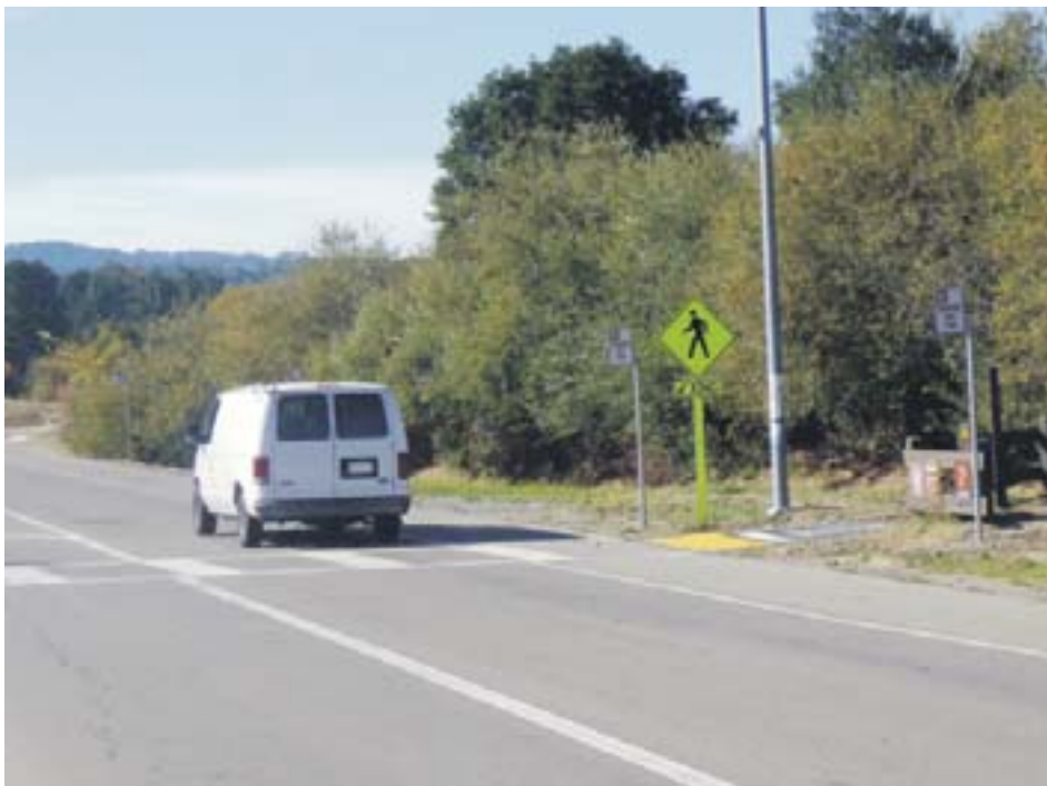
Crosswalk, trail entrance and no-parking signs on St. Mary's Road