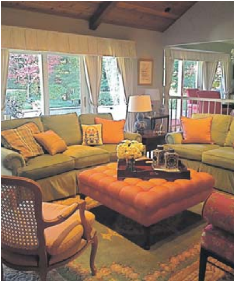
An oversized ottoman does double duty as a place for snacks and extra seating in a pinch.

Don't be afraid to mix metals. Layering brass, silver, and even chrome can add interest and keep everything from looking too staged.