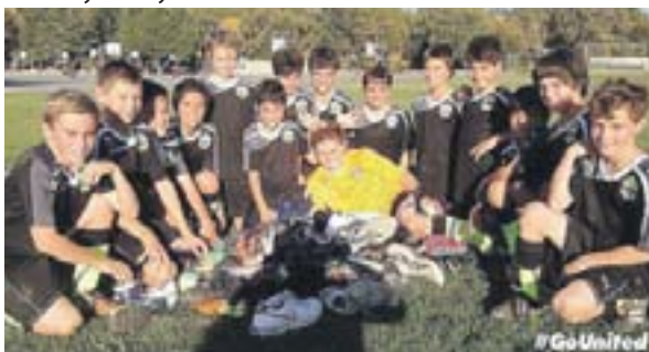
U12 boys' Navy team