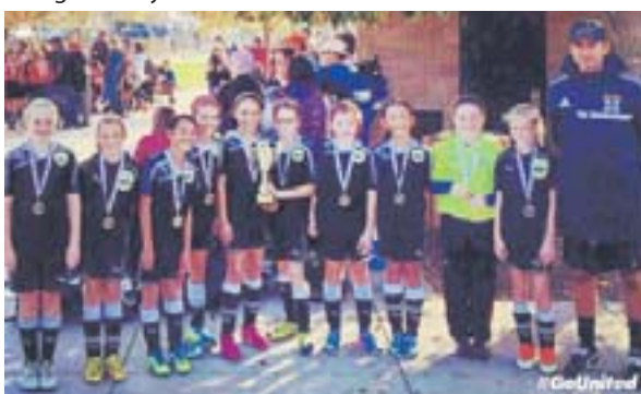
U11 girls' Red team