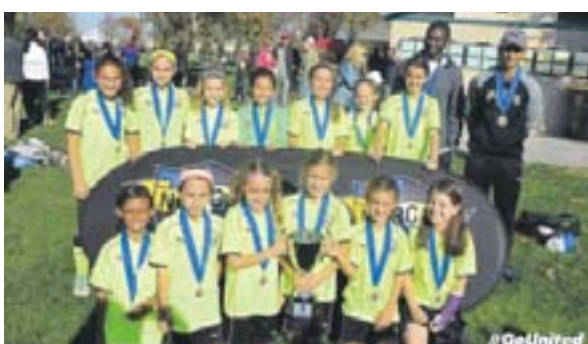
U11 girls' Navy team

The Sevens campaign started in August. After several tournaments, the Gaels qualified for the championship tournament after going 6-0 in the Battle of the Bay. The team's record in five tournaments was 27-3.