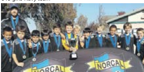
U10 boys' Navy team