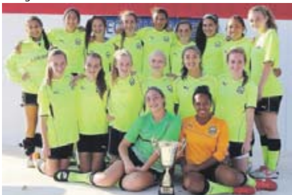
U15 girls' Navy team