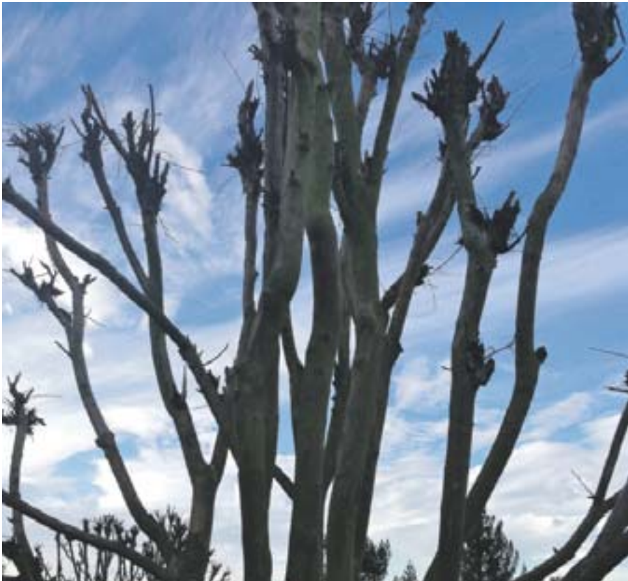
When pruned properly, crepe myrtles make a dramatic statement in the landscape.