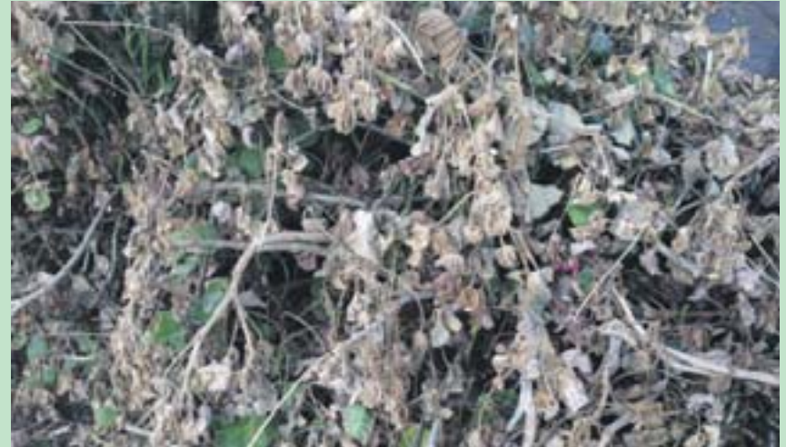
Geraniums look sad after the freeze. Once they are pruned in March, they return to their normal splendor.