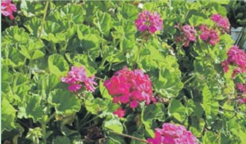
Geraniums before the freeze are pretty and perky.