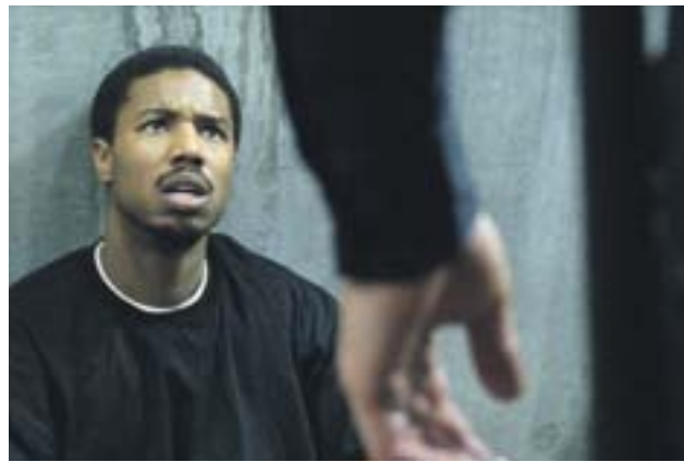
"Fruitvale Station" Photos provided

W ith a new year upon us, it is time to reflect on what I consider to be 2013's best movies of the year. It is always fun to generate the "Best of" list and realize what a good year 2013 was for movies that would have to be summarized by two key words: struggle and survival.