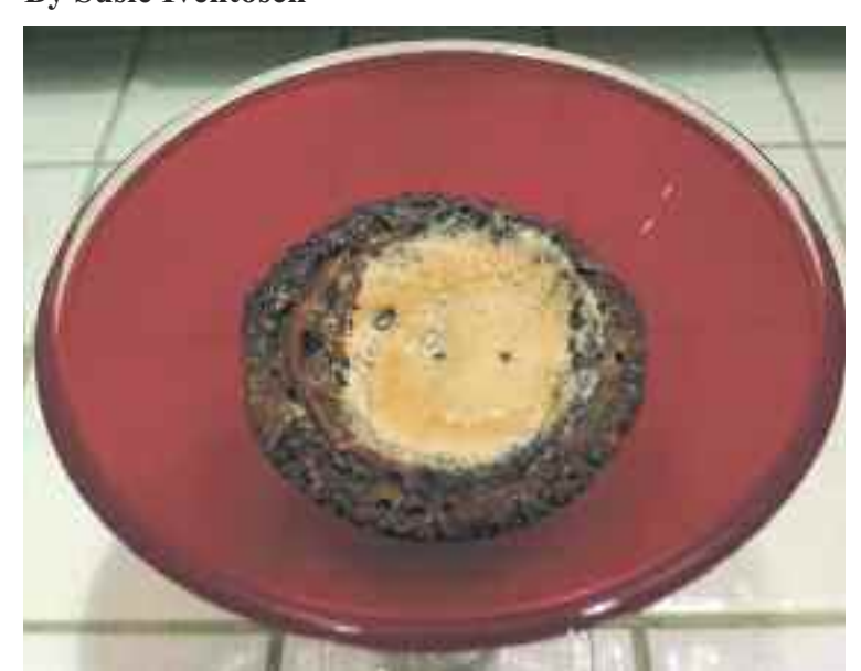
Marshmallow lava cakes for the lovies in your life!

magazine, which looked like a nice, ply the way the light reflected on the fluffy white center in the middle of cake and there were no marshmalthe lava cake. I thought, "Wow, what lows anywhere to be found in the way, so the marshmallow would a great idea, using marshmallows in recipe. This did not deter me, since show in the picture.)