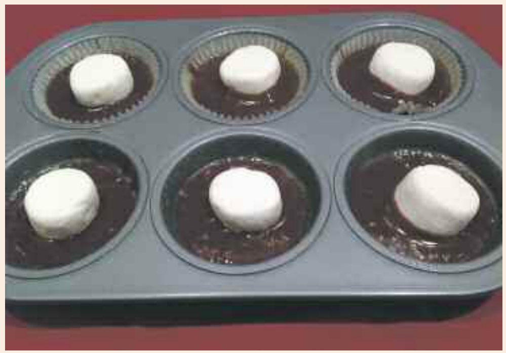
Lava cake batter with marshmallows

(Makes 12 regular muffin sized lava cakes, or 6 large muffin tins ... bake a little longer if using the large size.)