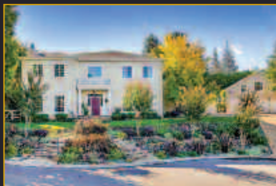
Monterey Terrace Orinda

Classic East Coast traditional style estate in a magical setting. 5500+/-sf main house with 5 bedrooms plus a 500+/-sf pool/guest house. Fabulous and private .90+/-acre lot. One of a kind!