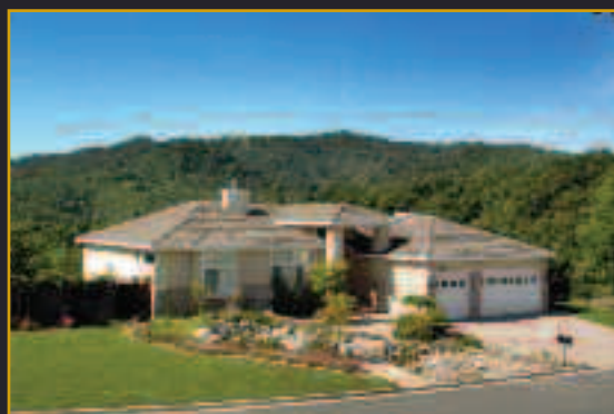
Sunrise Ridge Drive Lafayette

Popular Mariposa plan with 4 bedrooms and 3.5 baths. All main living areas including master suite and den on street level. Great panoramic views over Briones Regional and close to trailhead.