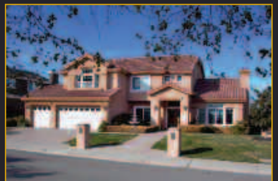
Sunrise Ridge Drive Lafayette

Highly upgraded and immaculate Briones model with 4 bedrooms and 3.5 baths. Beautiful landscaping on a premium panoramic view lot. Serene views of Briones Regional and close to trailhead.