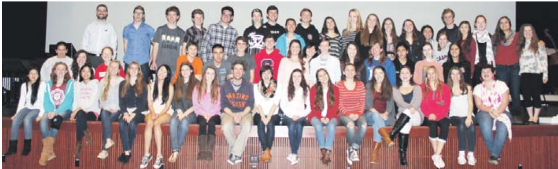
Performing arts students gather on the Campolindo High School stage during the Feb. 14 event.