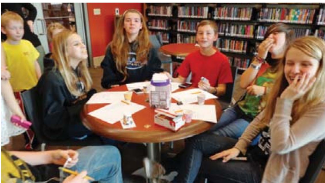
Gum Tasters share a laugh as they guess flavors and brands during a recent contest at the Lafayette Library Teen Center.