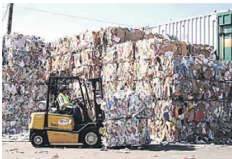
Pacific Rim currently recycles for Lamorinda