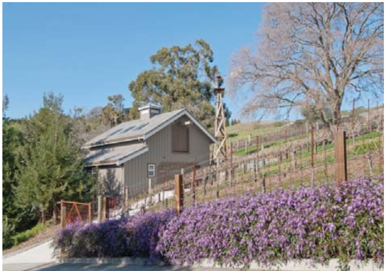
It might look like a barn, but this seasonal storage shed is equipped with a winch on steroids to lift heavy equipment back and forth.

Spelunkers have known the secret for years – crawl down into an existing cave some 20 or 30 or more feet, and you get into the special thermal realm of 50 to 55 degrees, a perfect temperature for storing wine. It can be 100 degrees outside, or even below freezing, and still 55 down in the caves. So Rey called Kattenburg, and Kattenburg called in the bulldozers. The equipment started