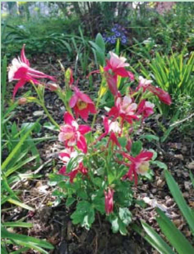
Columbine, an Aquilegia hybrid and delphiniums do well in a sun-dappled shade garden.