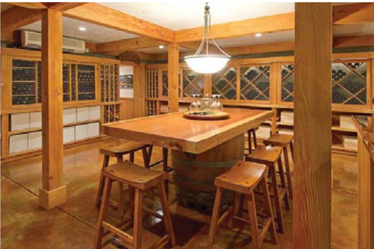
Reliez Valley Vineyards has more than one area for tasting and mixing, including this subterranean room that also serves as a tasting area for micro-brewed beer.