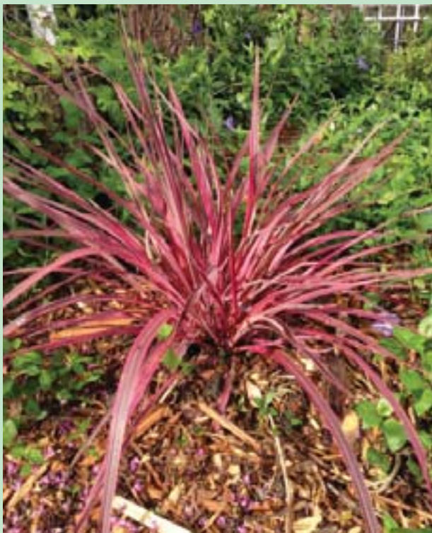
Cordylines and New Zealand Flax add texture and color to a landscape.