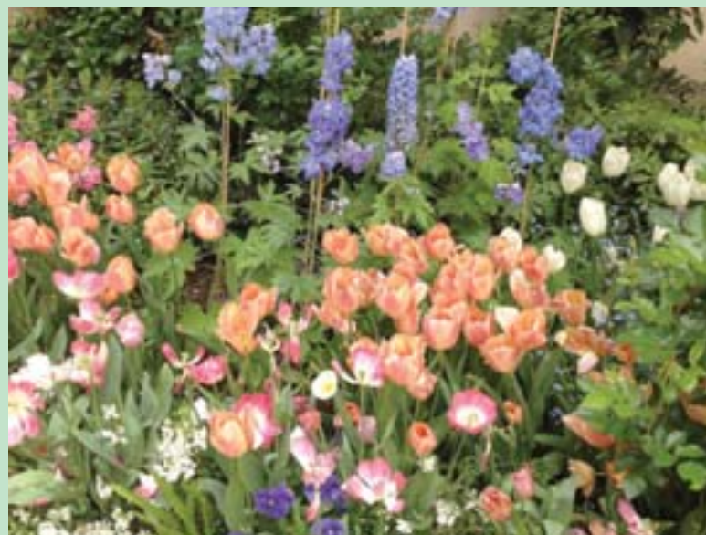
A parade of spring color with delphiniums, tulips, and pansies.