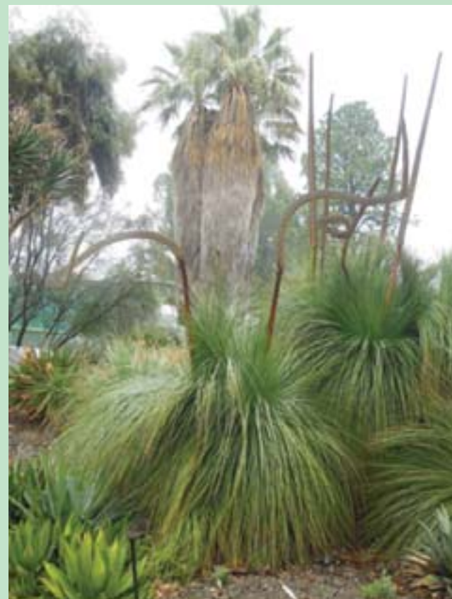
Grasses can be privacy screens. This Australian grass tree also sports fascinating spires that resemble horns at the Ruth Bancroft Garden in Walnut Creek.