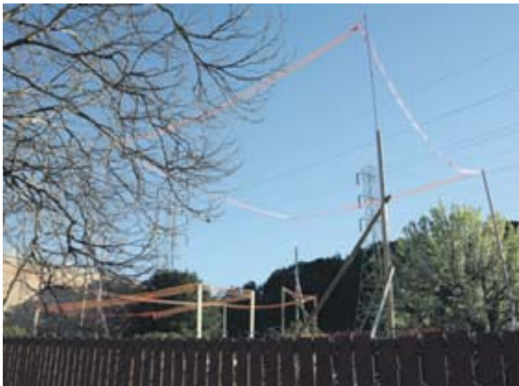
Story poles at 25 Orinda Way.