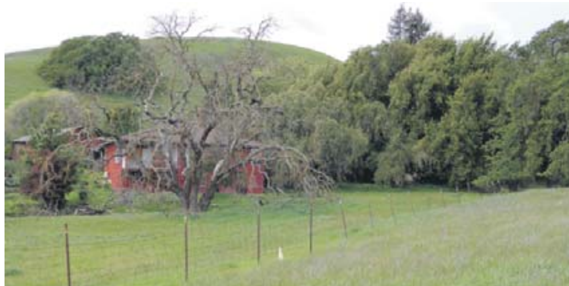
View of the abandoned red house on Deer Hill Road where the Alternative Plan dog park could be located – if the revised Terraces project is approved.

Although “Alternative Plan” documents of the redesigned Terraces of Lafayette housing project are still being reviewed by the city, there has been some discussion about the size and location of the proposed dog park that was part of the amenity package for this new plan. Back in January, the City Council approved a Process Agreement that provides for an expedited review process of the smaller version of the “Terraces” which calls for 45 homes clustered together, compared to the original 315-unit plan, on the 22-acre parcel.