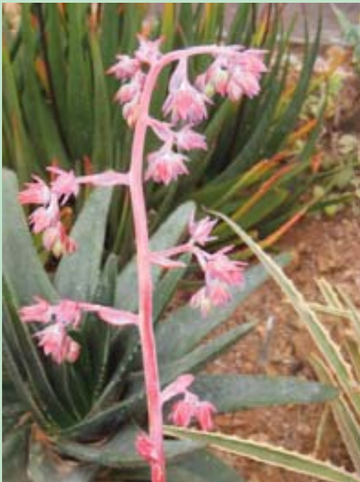
Echeveria are excellent choices for xeriscaping.

May flowers depend on more April showers thus we'll continue our rain dances. Wishing you a very Happy Easter and Passover. Happy Gardening! Happy Growing!