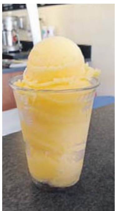
Mango Italian ice at Chillers in Orinda

nation of cream and caffeine. SiSi's is located at 910 Country Club Drive, Moraga. For information, call (925) 377-1908.