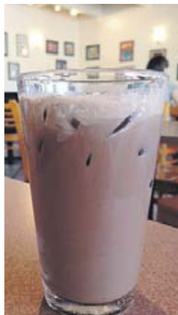
Iced mocha from Papillon in Lafayette