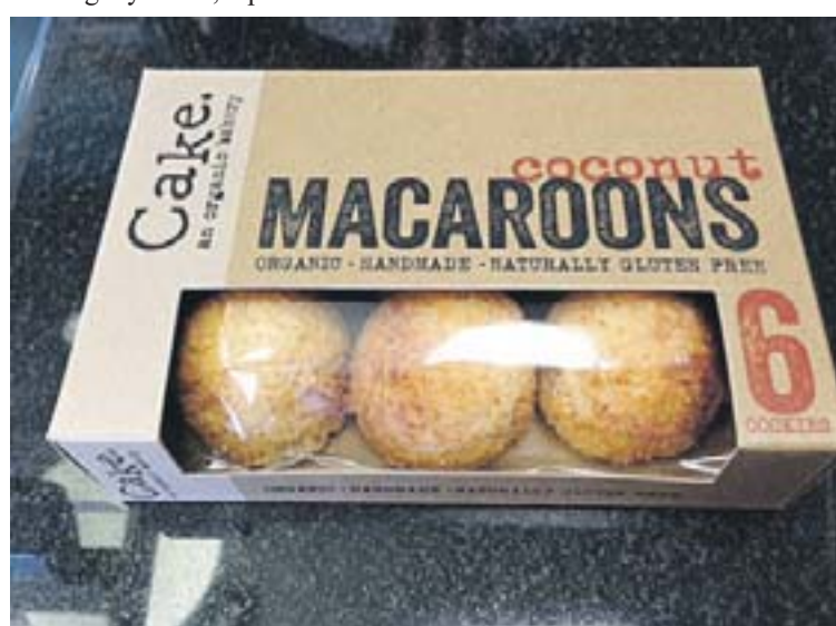
Coconut macaroons at Cake in Lafayette