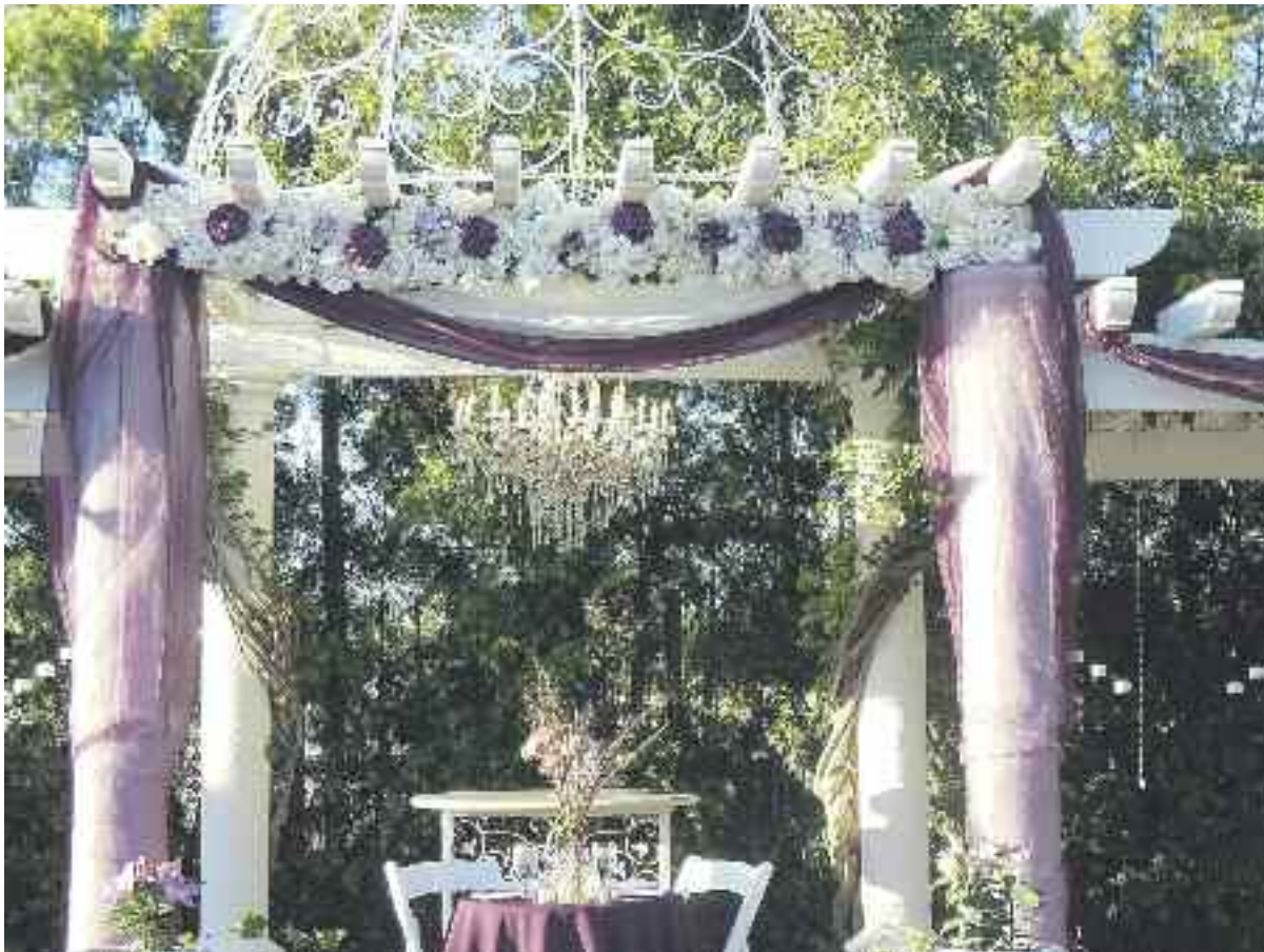
Sweetheart table dressed simply beneath an elaborate columned pergola with twisting wisteria vines and urns planted with stargazer lilies.

“Love is to the heart the harvest of all the loveliest flowers of the soul.” – Author Unknown