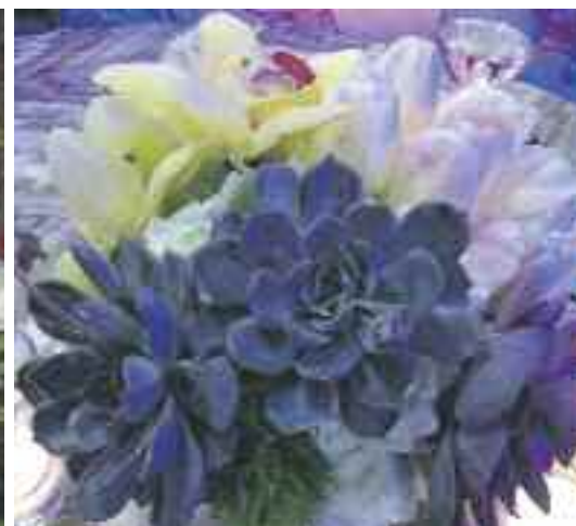
Succulents, tulips, and orchids are low centerpieces for this event.