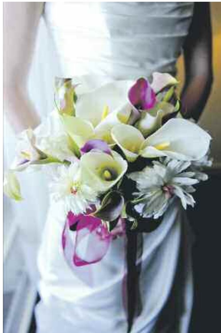
A lush DIY bridal bouquet of dual colored calla lilies flanked by peonies reflecting the color scheme of the wedding.