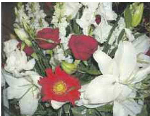
Holiday bouquet with traditional red and white roses, gerbera, lilies, snapdragons, and gladiolus.