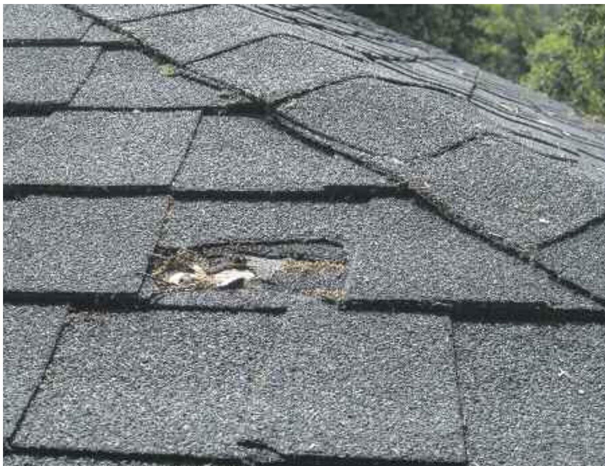
A summer roof inspection can reveal surprises. This hole in a Canyon roof was discovered after a tree contractor left. Evidently a heavy branch pierced the roof, which can lead to problems in the winter rains.

“Don’t panic when you get a leak, especially in a rain storm that’s coming from a direction that’s different than usual,” Eva said recently while supervising the installation of a new roof on a remodel in Lafayette. “When it’s really raining, and there are high winds, the water is going to get blown in somewhere.”