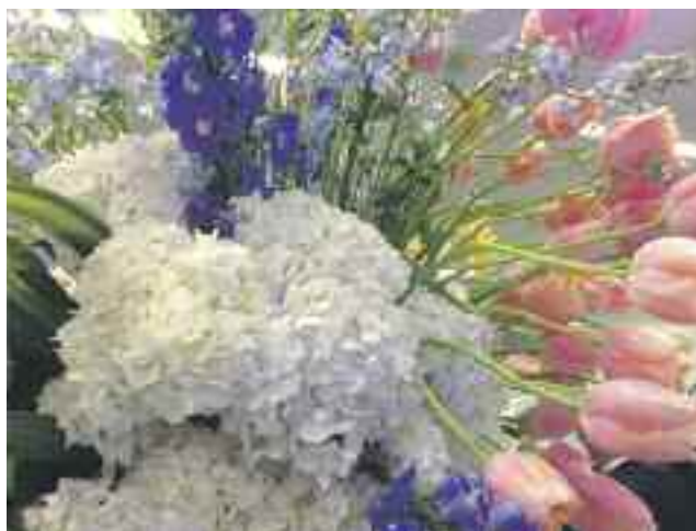
A dramatic table arrangement of white hydrangeas, blue delphiniums, and apricot tulips.