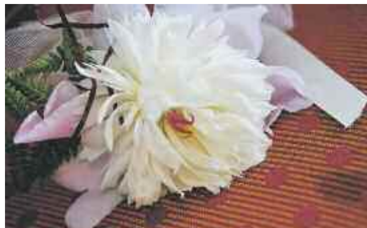
A pale pink and white peony with a sprig of fern makes a beautiful corsage.