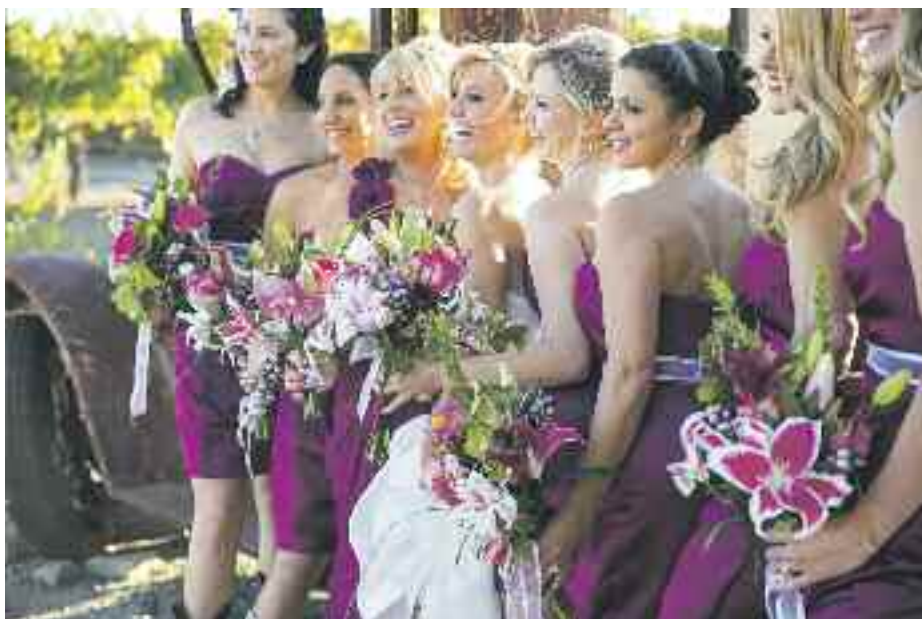
The bride and bridesmaids with the individualized bouquets they created at the Flower Power party. Flowers included stargazer lilies, liliun speciosum, purple sage, lavender, gardenias, roses, alstroemeria, narcissus, freesia, grape leaves, razor grass, flax, and a grape bunch ornament.