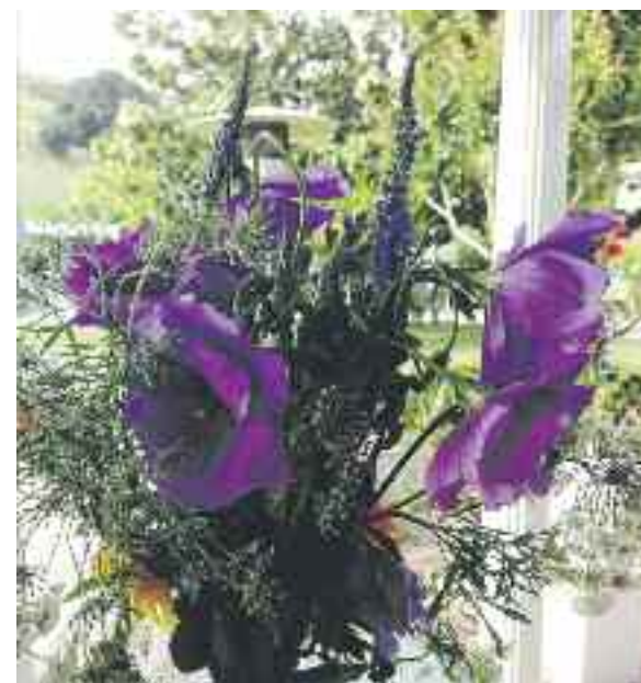
Use wild flowers including Queen Anne's Lace and thistle arranged in a jar for rustic or casual displays.