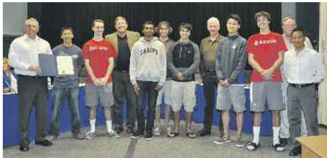
The Town Council and the Campolindo boys' varsity volleyball team.

The Moraga Town Council issued two proclamations June 25 for two very different sports groups. First it honored the Campolindo boys' varsity volleyball team, which recently won its fourth consecutive North Coast Section Championship and second NorCal Regional Championship. The team was ranked No. 1 in the East Bay and No. 8