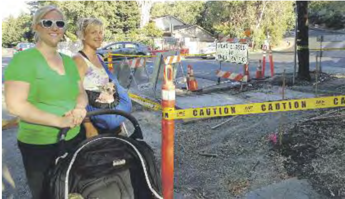
Evening walkers at the intersection of Reliez Station Road and Olympic Boulevard near one of 17 utility structures undergoing work.

Burton Valley residents aren't thrilled; neither are Moraga drivers.