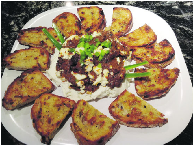
Grilled Peach-Jalapeno Compote tops a cheesy blend.

Reach the reporter at: suziven@gmail.com