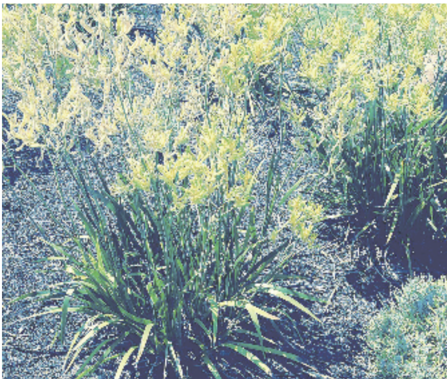
Kangaroo paw is available in a variety of colors. It's drought and deer tolerant with long lasting conversation inducing flowers.

Summer is winding down and autumn is fast approaching. For gardeners, it's a time for deadheading our perennials to keep them flowering until the first frost. September is the time to determine if you want to plant a fall vegetable garden to provide fresh vegetables throughout the colder season without the headaches of weeds, pests, and water conservation. This month is also the time to plant a cover crop to enrich tired soils with vital organic matter, adding nitrogen while protecting the bare ground from erosion. Cover crops suppress weeds and improve the overall structure and water retention capacity of soil. Water conservation is an ongoing challenge. Scientists have now changed their prediction of an El Niño this winter from an 80 percent chance to less than 60 percent. Even if we do get substantial precipitation, drought conditions will continue to prevail. Keep water awareness in mind when planting this fall and choose drought resistant species whenever possible. Ornamental grasses take center stage as they sway in the wind with their feathery fronds offering texture and beauty with minimal water requirements.