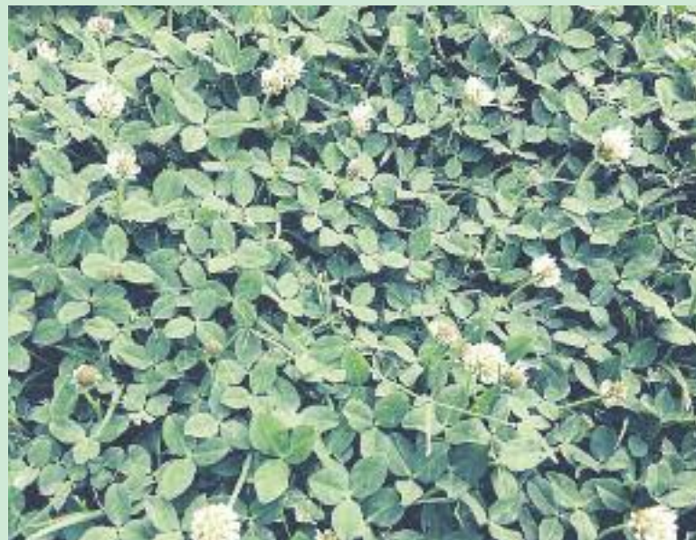
Throw clover seeds in the lawn to enrich the soil.