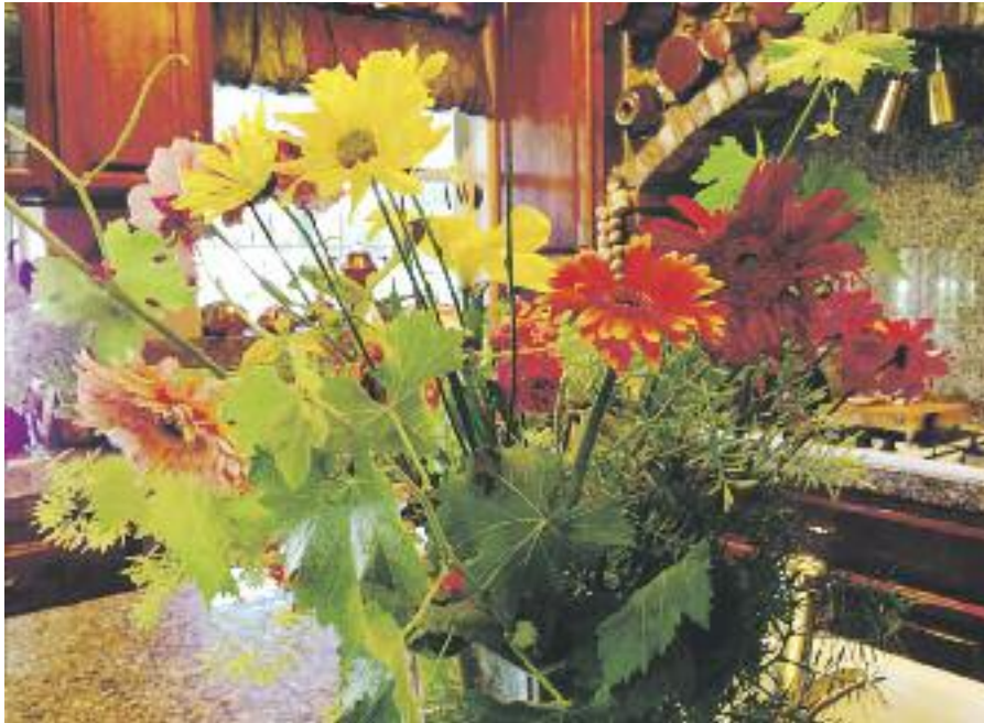
Fill a vase with orange and yellow gerbera, grape leaves, and asparagus ferns to brighten your autumn kitchen.

"Count the garden by the flowers, never by the leaves that fall." ~ Source unknown