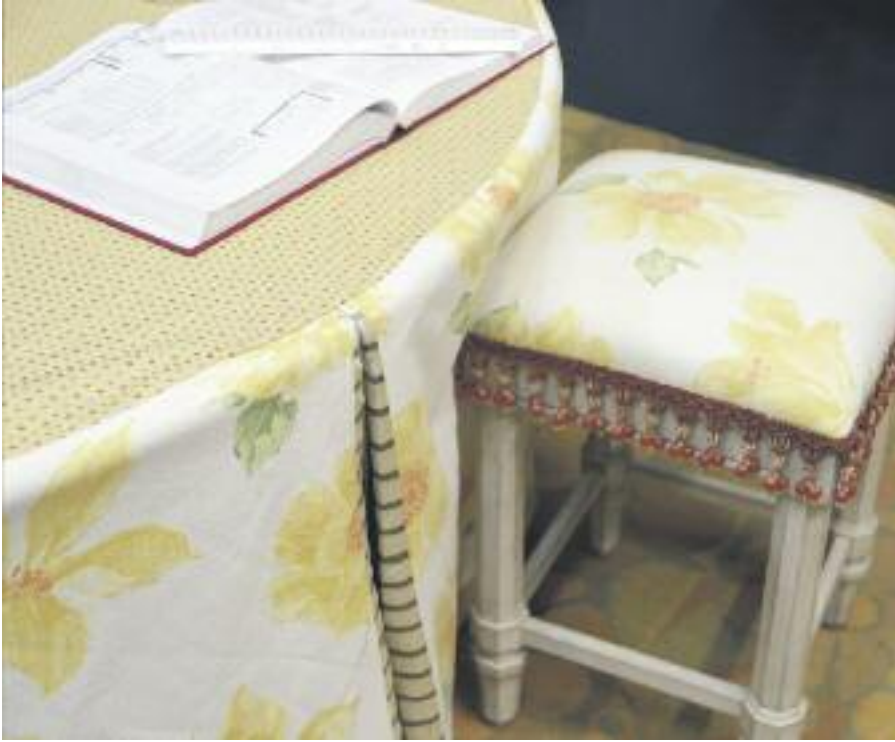
Round tables from Kmart ship to home, covered with Couture Chateau custom-lined and interlined table cloths, are incredibly functional and multi-purpose.

3) Chip It. This is one of the biggest things we tackle when clients ask for what we call “focus space.” This is my design term for highly functional work stations within our design world. I could banter all day about how much color matters in design but suffice it to say, choosing a color palate that speaks to you is one of the hardest and most important things people do, especially when it comes to creating functional work spaces that call you back to productivity.