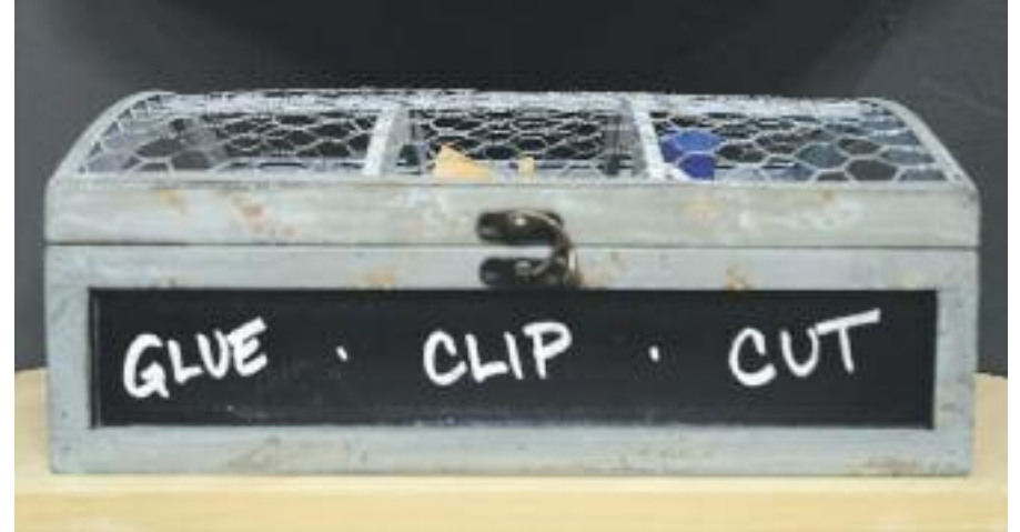
This clearly labeled box keeps supplies tidy.

And if you need some help creating those focus areas or getting a guest room in order for the holidays, call us. We’re here! Until then, live a custom life!