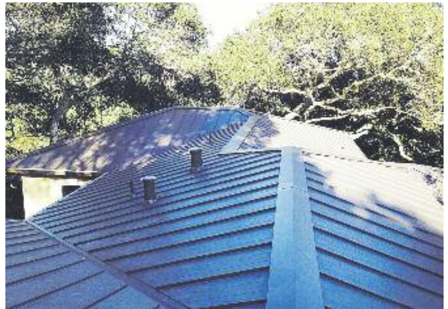
This specially grooved metal roof will harvest approximately 50 percent of the water that hits it, diverting it to a cistern below.