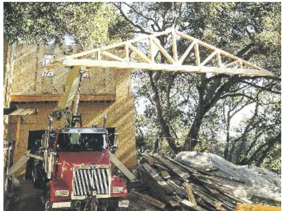
Heavy roof trusses and mature trees make for a tricky installation.