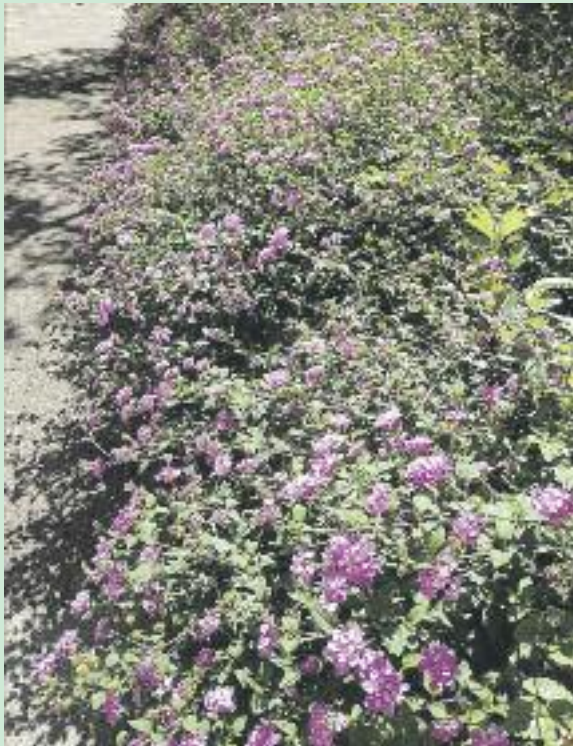
Add lantana to cascade over a retaining wall to soften the pathway.