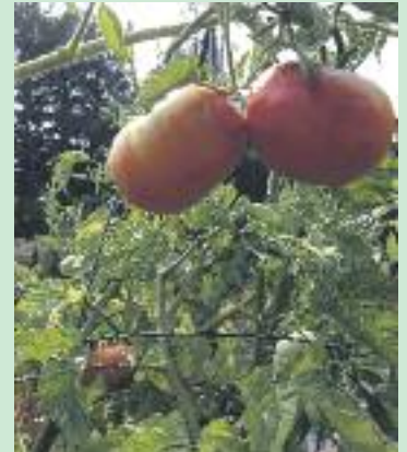
There is nothing tastier than tomatoes straight off the vine.