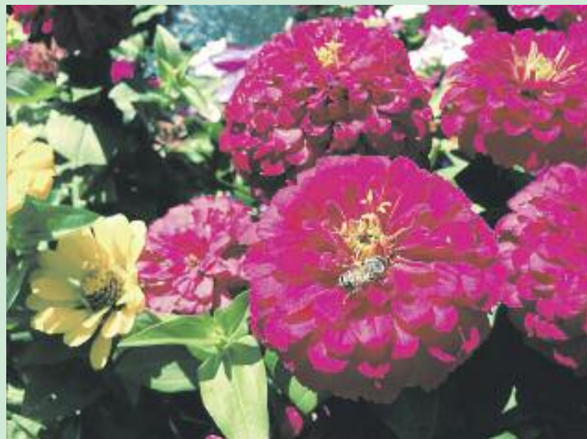
Bees are still working hard at pollinating. This bee feeds on a colorful zinnia.