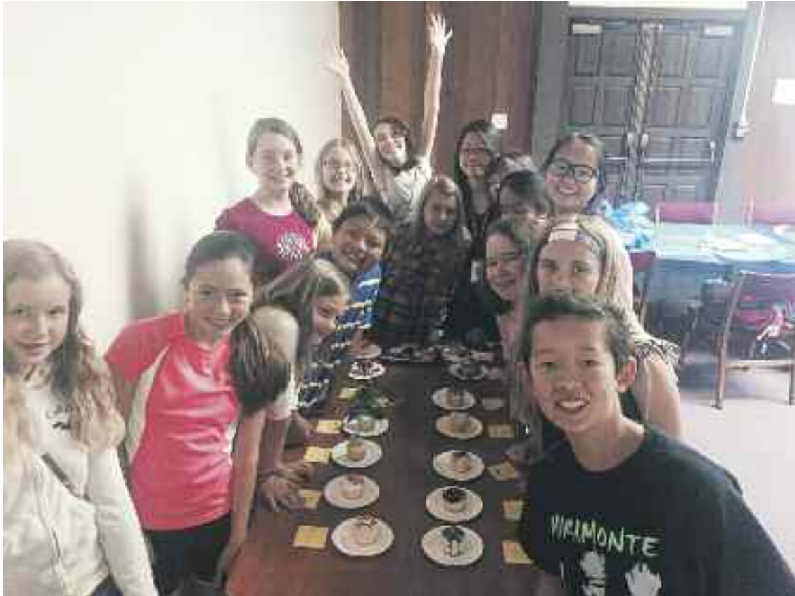
Teens and tweens had fun decorating cupcakes at the Moraga library.