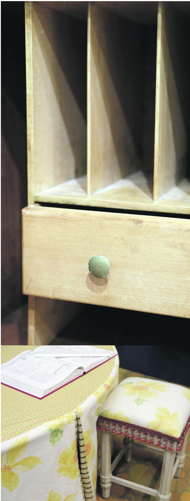
Round tables from Kmart ship to home, covered with Couture Chateau custom-lined and interlined table cloths, are incredibly functional and multi-purpose.