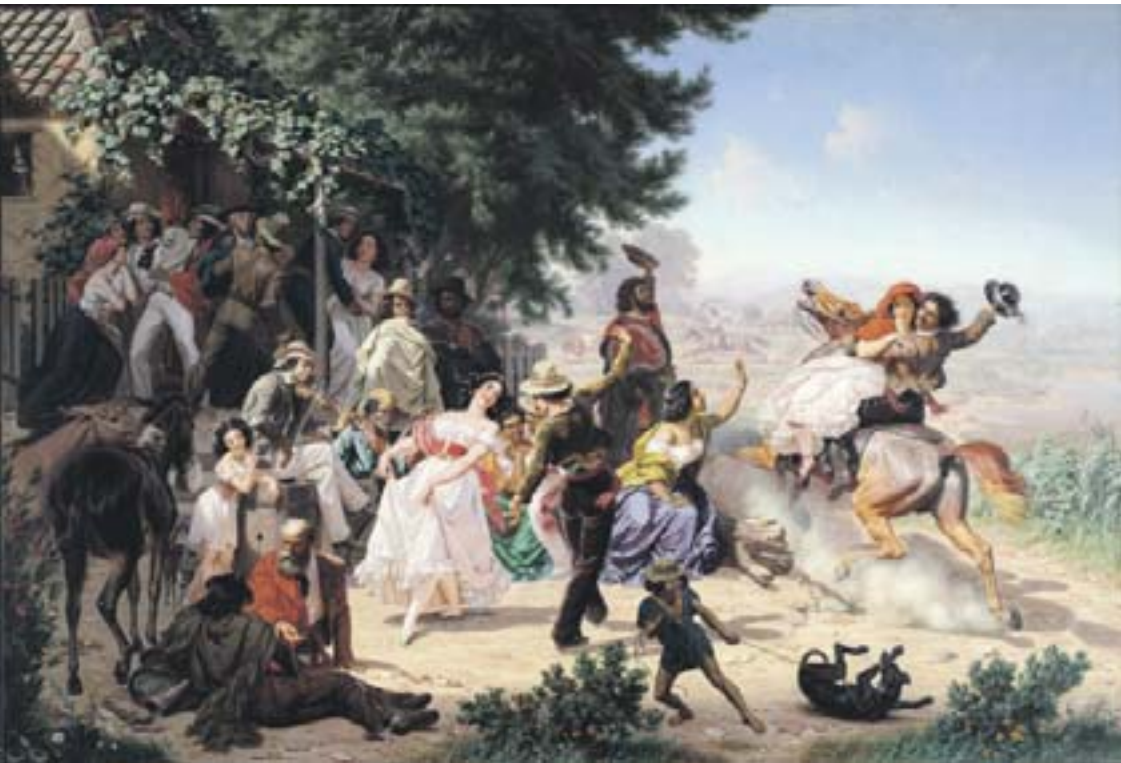
The joy of work done and relaxation begun. "The Fandango," painted by Charles Christian Nahl in 1873, depicts Californios dancing at a fiesta as vaqueros finish branding their cattle. Oil on canvas, E.B. Crocker Collection.

"The present is the ever moving shadow that divides yesterday from tomorrow. In that lies hope." – Frank Lloyd Wright