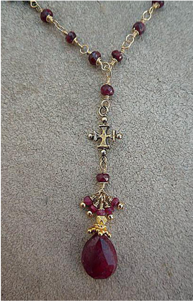
Ruby Drop Necklace from Divinity Jewelry.