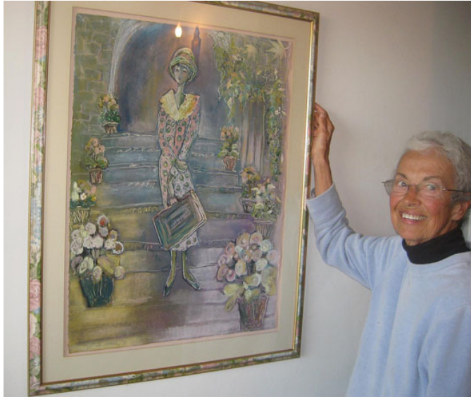
The artist with one of her pieces.