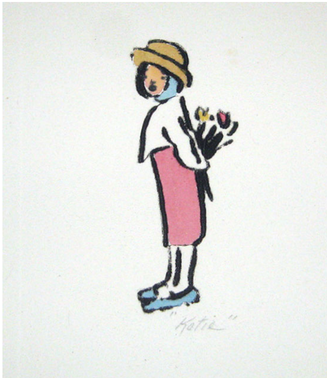
"Katie" by Lyn White