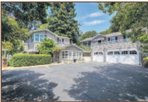
51 Rheem Boulevard, Orinda $2,798,000