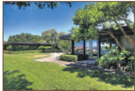
92 Sandhill Road, Orinda $4,475,000