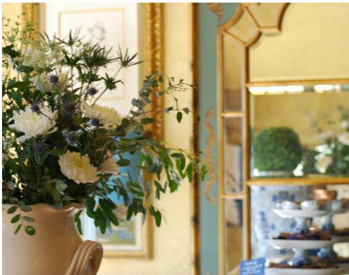
Dining room floral for a recent event. Notice the reflection in the mirror of the topiary.

Topography: Look up, look down, look around. I have this 'thing' my assistants joke about – watch what she does with the ceiling! I love using varied heights and unexpected ingredients to draw the eye up, down, into and out of various spaces. You'd be shocked what you can do with a bolt of fabric. For one featured event we used 35 yards of navy sheer fabric. Up on a ladder, we literally threw the bolt over the beam, tacked it and then carefully placed magnolias from the Dollar Store in Moraga to give it interest. We used the draping in four areas of the event. This draping (topography) lent itself to transition from one area to another while providing fun visuals during the buffet (type).