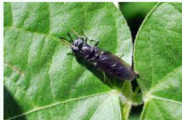
Black Soldier Fly