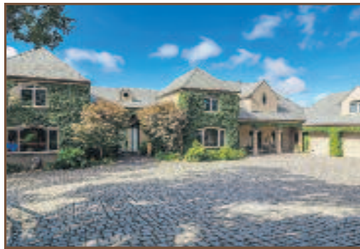
23 Sessions Road, Lafayette $3,895,000