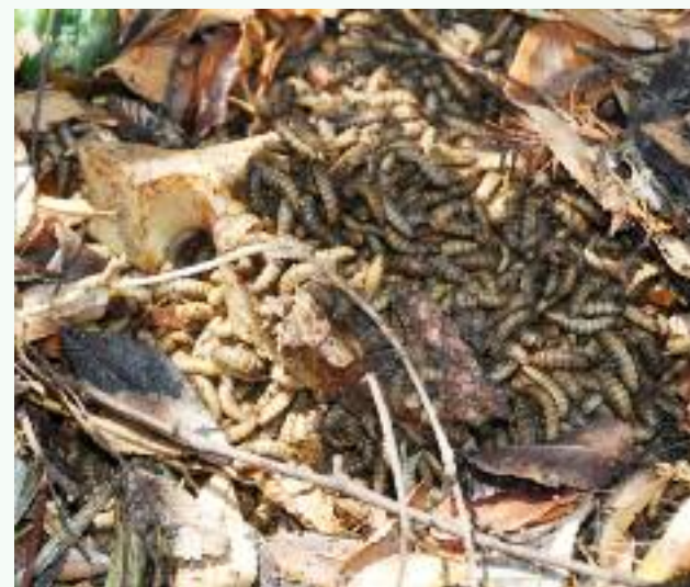
Black Soldier Fly larvae eating the meat off a bone

As I wish you and your little princesses, pirates, and pumpkins a happy and safe Halloween, I leave you with a bit of garden Halloween humor: