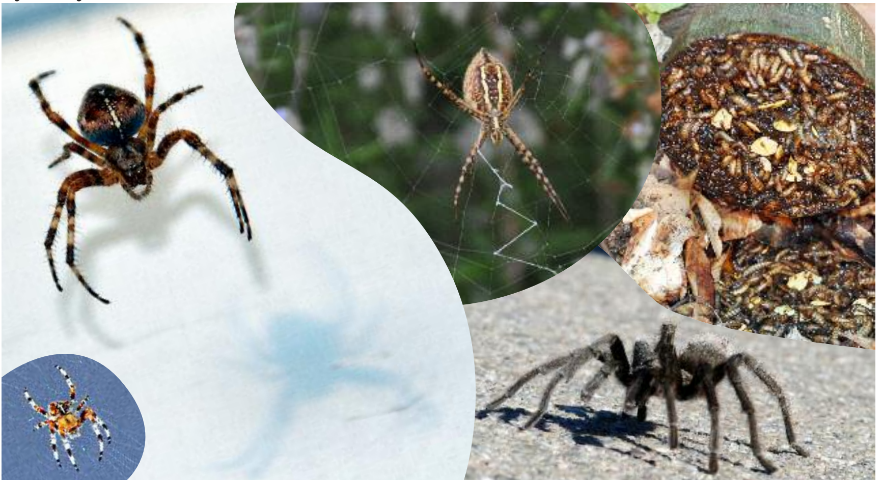
Top and bottom left: Araneus diadematus (cross orbweaver); middle: Argiope aurantia (yellow garden spider); top right: Black Soldier Fly larvae; bottom right: tarantula on Mount Diablo