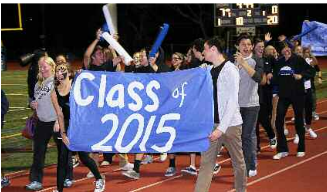
Acalanes High School seniors celebrate after winning the Oct. 6-10 Student Spirit Competition.