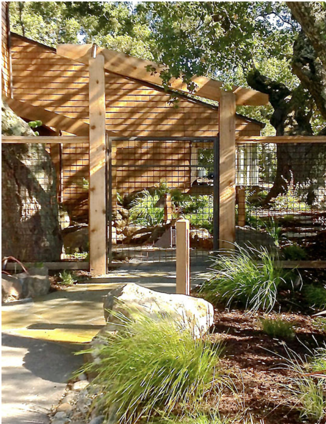
The inconspicuous fencing almost disappears visually but still keeps the deer at bay.

Garden Lights Landscape & Pool Development 1 Northwood Drive, Suite #7, Orinda, CA 94563 Office (925) 254-4797 Fax (925) 254-3211 email: office@gardenlightslandscape.com