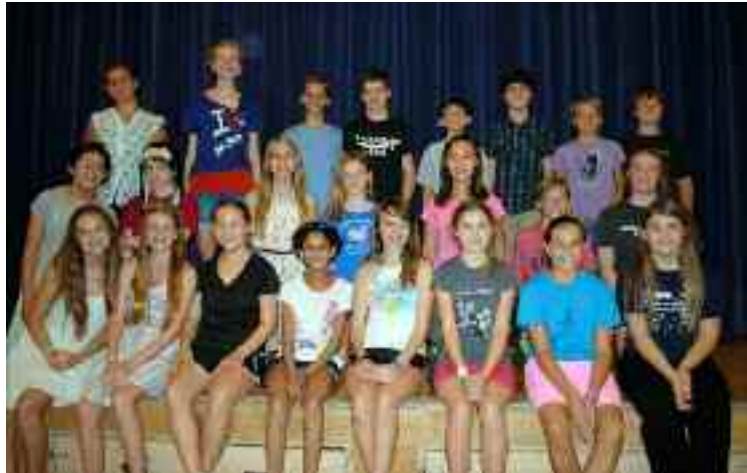
"The Snow Queen" Icicle Cast