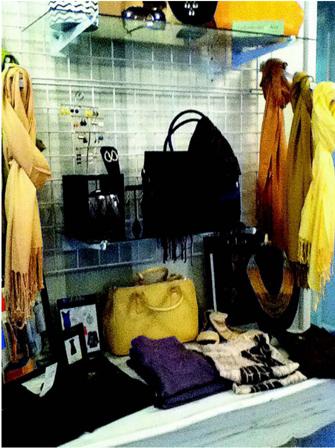
Leggings, tunics and more are available at Glamorous Boutique.

Reach the reporter at: info@lamorindaweekly.com