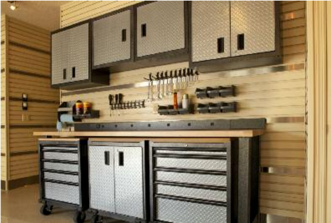
Garage storage systems and shelving units can help keep your items organized and avoid encroaching clutter.

7. Next, organize your master bedroom, bath and closets, creating a vision for what should be sacred adult space. Repeat all the above steps. From a feng shui perspective, if we make improvements in the master bedroom power area, where rest and romance nurture the keepers of the castle, that positive energy will spread to the rest of your home. No room in a home is more important to a couple or an individual than their bedroom.