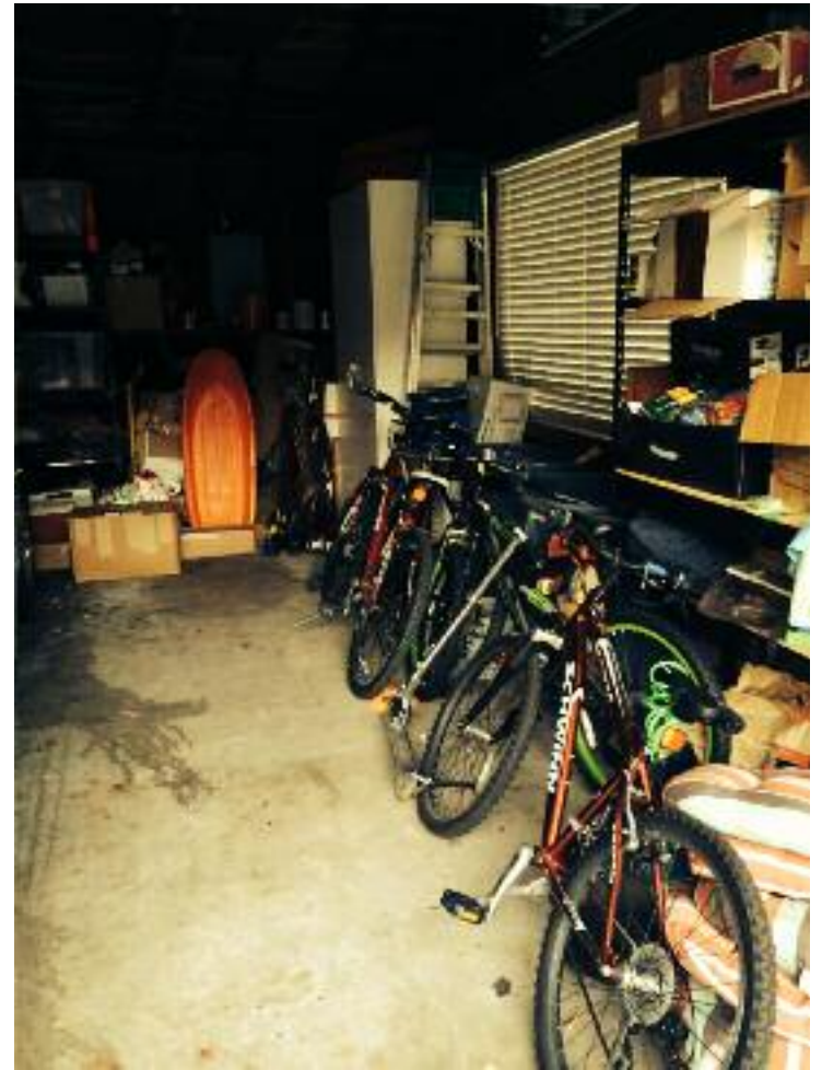
Although shelving is used in this garage, the amount of boxes and items on and near the shelves has led to disorganization and a sense of chaos.

Now please go scan this article, then throw it away! Happy New Year!