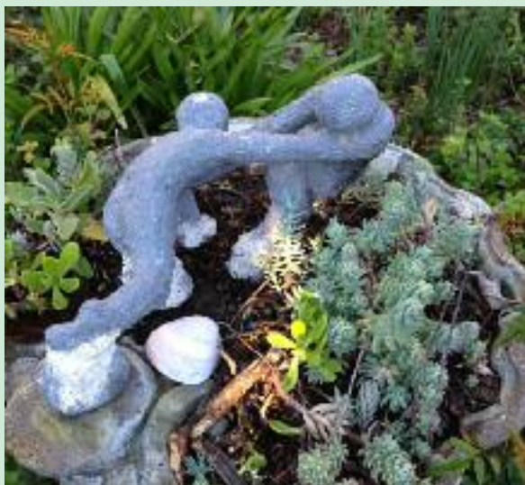
An iron sculpture tops a birdbath filled with succulents.