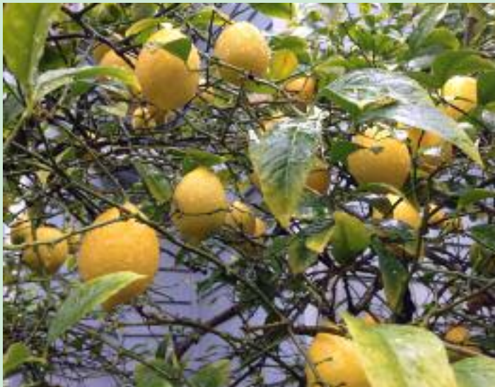
Rain drops on the Meyer lemons.