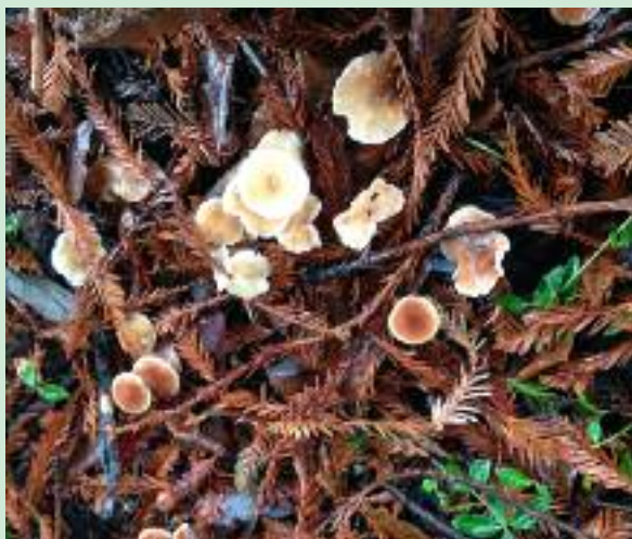
Mushrooms growing in the redwood mulch look delicious but are probably poisonous.