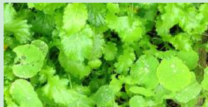
Organic baby lettuces will produce all winter long.

Have a safe, happy, and healthy New Year.