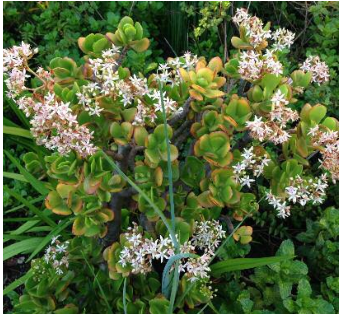
What a lovely surprise to see Jade in bloom in the winter.