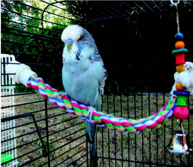
Perchy the parakeet

Lamorinda teens work hard. Between volunteering, studying and athletics there is hardly any time left for quality time with family, let alone the family pet. Almost 70 percent of U.S. households have at least one domestic pet, according to the American Pet Products Association, and recent studies have linked pet ownership with reductions in loneliness and depression, as well as other health benefits, so we must not forget to always cherish our most loyal and incorrigibly joyful family members, our pets.