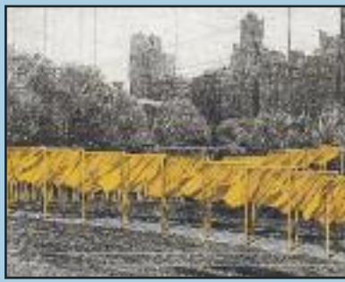
Collection of the Sonoma County Museum

An extraordinary traveling exhibition of a unique collection of works of art by renowned artists Christo and Jeanne-Claude will visit the Saint Mary's College Museum of Art. The collection