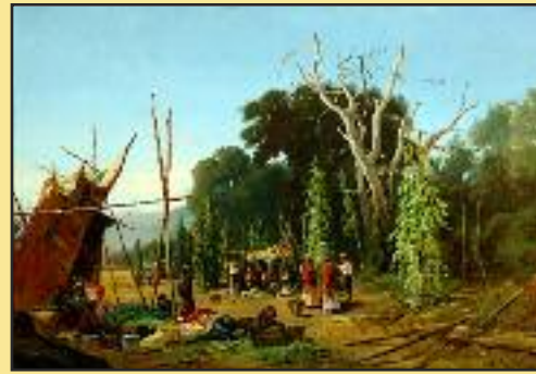
Collection of the Saint Mary's College Museum of Art