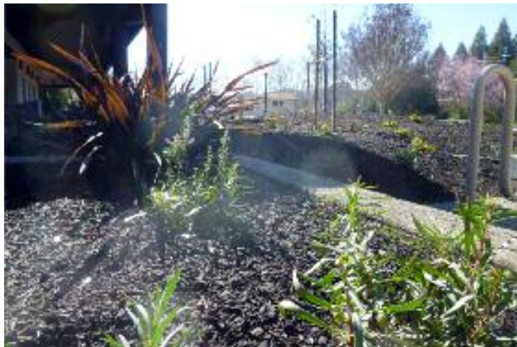
The new garden in front of the library