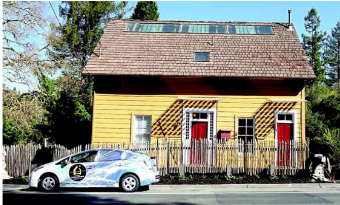
The Old Yellow House, now fully restored