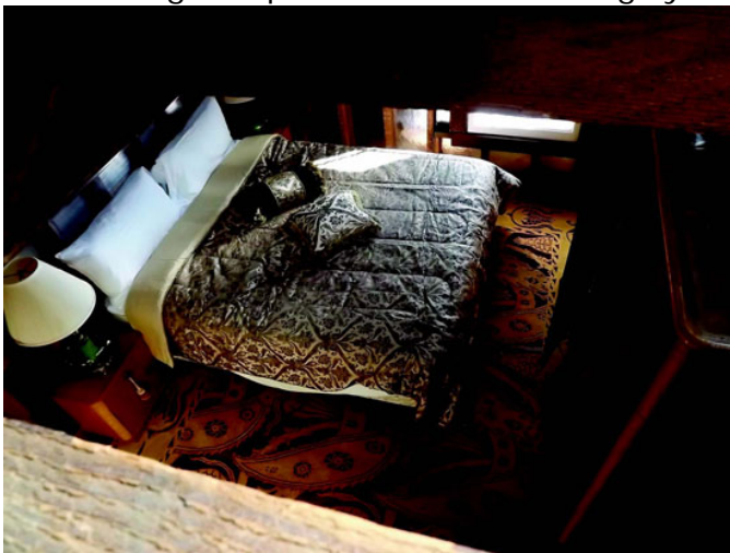
Looking down from above on a second story bedroom. No ceilings!