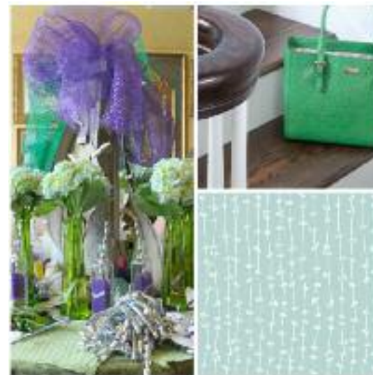
Green is known for indicating balance, growth, stability, abundance and peace – all things we want to bring into client homes and spaces.