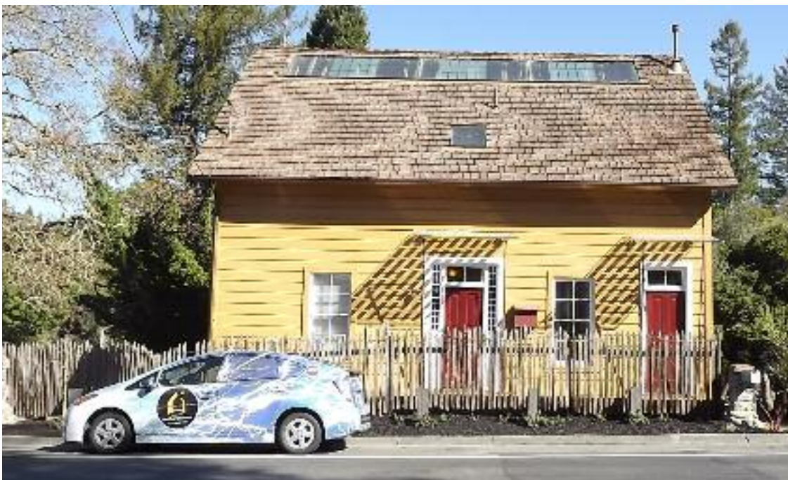
The Old Yellow House, now fully restored