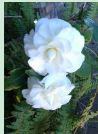
White camellias amongst the ferns are as showy as gardenias.