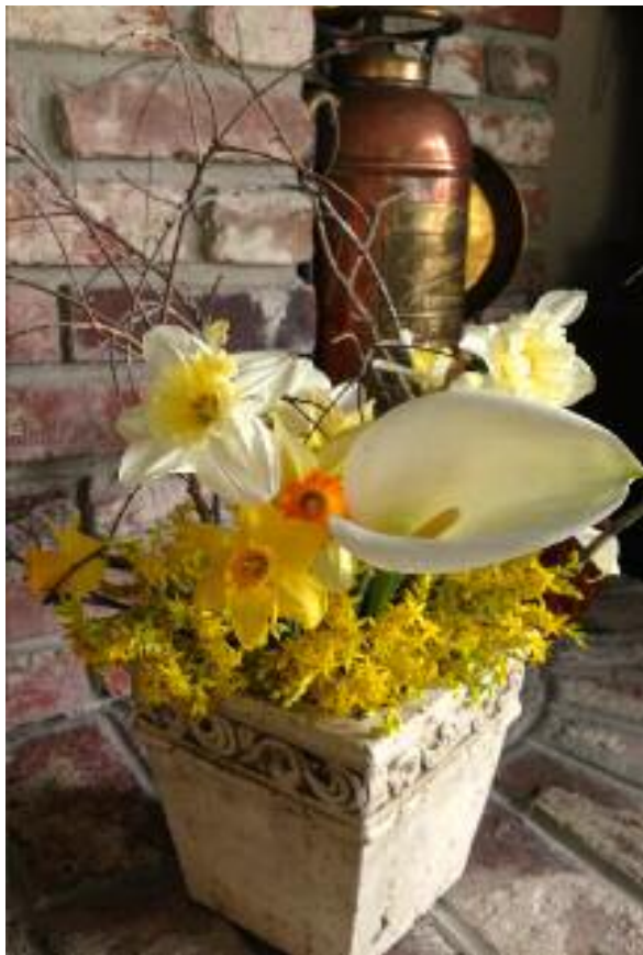
A rustic arrangement of daffodils, succulents, calla lilies and twigs.