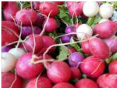
Radishes do not need as much sunlight to produce great crops.

As I sit here planning my spring edible garden, I'm wondering if all vegetables need lots of sunshine to bear fruit. I have sun and shade but probably not enough sunshine for everything I want to grow. Any suggestions?