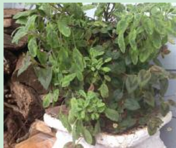
Sage is a great choice for a planter outside your kitchen.