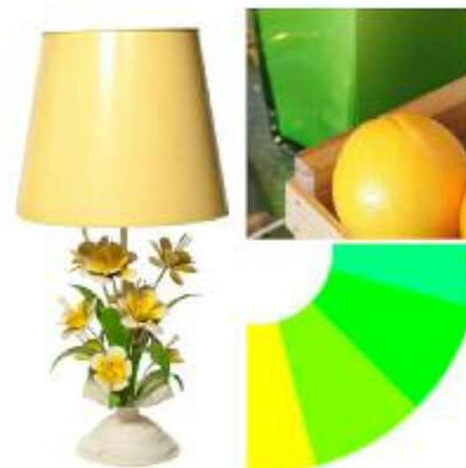
This antique Italian Tole lamp has gone to live with a client in Florida, but is was incredible. I share this so you are free to go bold.