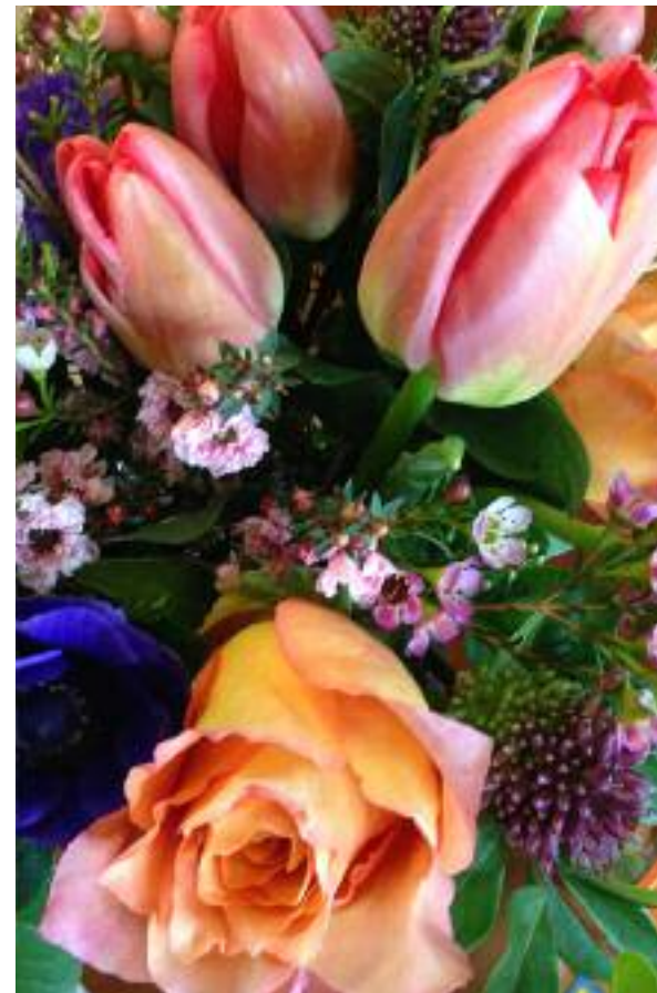
Does any flower top tulips for signaling spring?