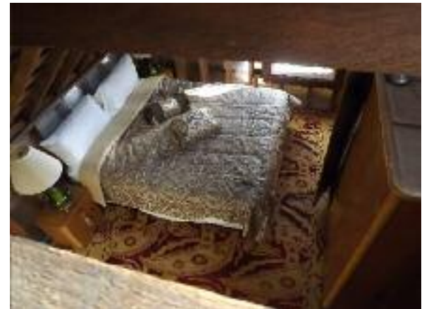
Looking down from above on a second story bedroom. No ceilings!

But it's time to pay the bills, Wright says, and “I have to go back to work.”