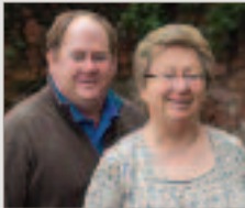
THE CHURCHILL TEAM