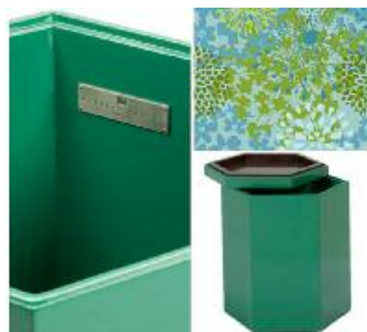
This Barclay Butera piece is more stationary than movable, but for small visible laundry areas, it's a great touch.