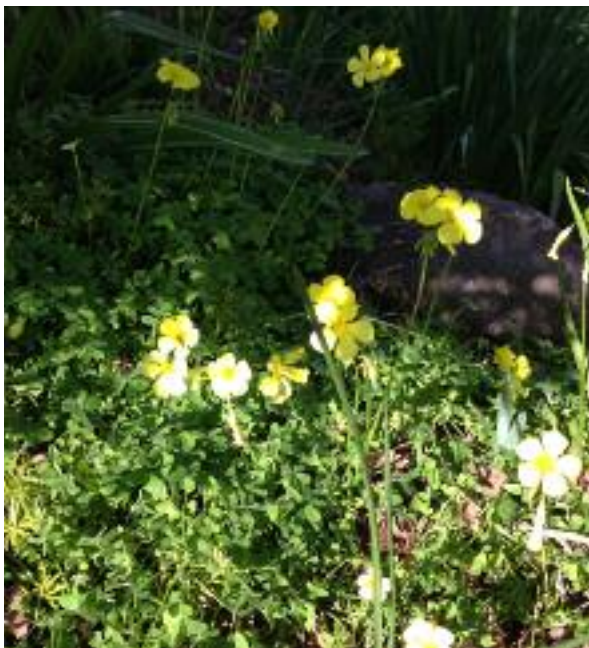
Yellow oxalis is also known as shamrock, perfect for St. Patrick's Day.

"Conservation is a state of harmony between men and land." ~ Aldo Leopold