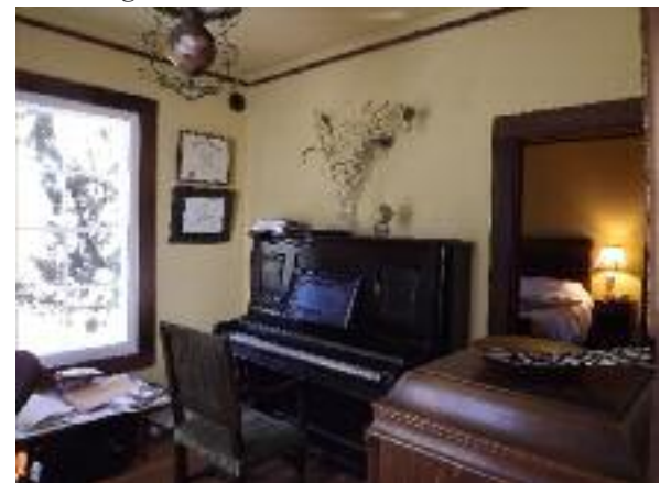
The parlor features an upright piano and Victrola.

A HIGHLY EXPERIENCED, PROFESSIONAL AND PERSONAL APPROACH TO REAL ESTATE.