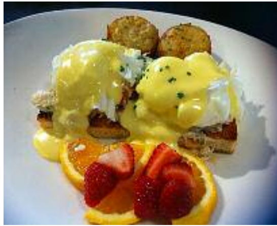
Metro's Crab Benedict