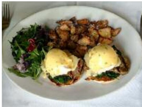
Kansas City Benedict

Too many choices have you looking for a prix fixe option? Check out the three-part prix fixe brunch menu at Lafayette's Metro, urban sophistication in a suburban setting. Select a starter of apple fritters with crème anglaise or Strauss organic yogurt topped with Café Fanny's granola, choose a main dish of Croque Madame, Eggs Florentine or Metro Benedict, and pair your morning meal with a cocktail or refresher of choice. Savor your selec-