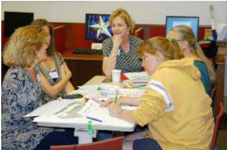
Lafayette residents gather at the March 19 Community Conversation meeting to discuss the future of their city.