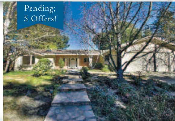
Pending: 5 Offers!