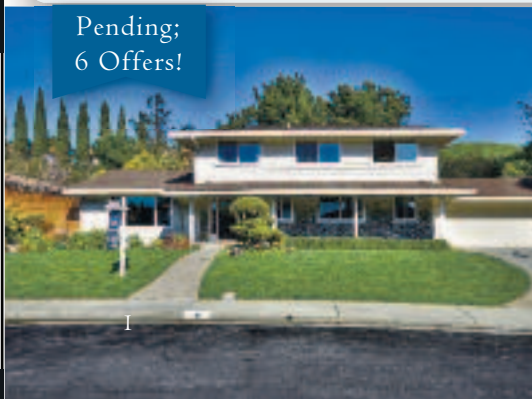
Pending: 6 Offers!

127 Shuey Drive, Moraga Updated 3934 sqft home with 5 Br, 3.5 Ba. Wonderful backyard with outdoor kitchen & spa. Great for entertaining. Call for Price www.127ShueyDr.com