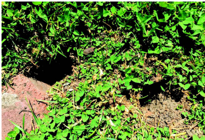
Vole holes in the lawn must be dealt with to eradicate these destructive creatures.-