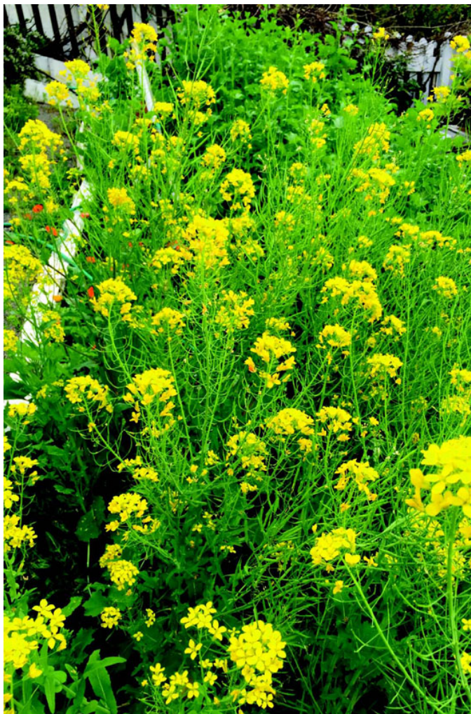
Mustard flowers and leaves are delicious in salads and the entire plant is good for the ground.