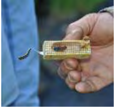
The queen bee arrives in a cage and will be released by the worker bees after a day or two.

Based out of a desire to help the plight of the honeybee, McDonnell Nursery in Orinda recently purchased two hives to put on their property.