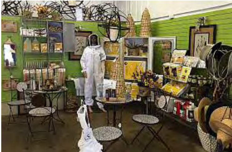
Orchard Nursery and Florist's retail display of equipment