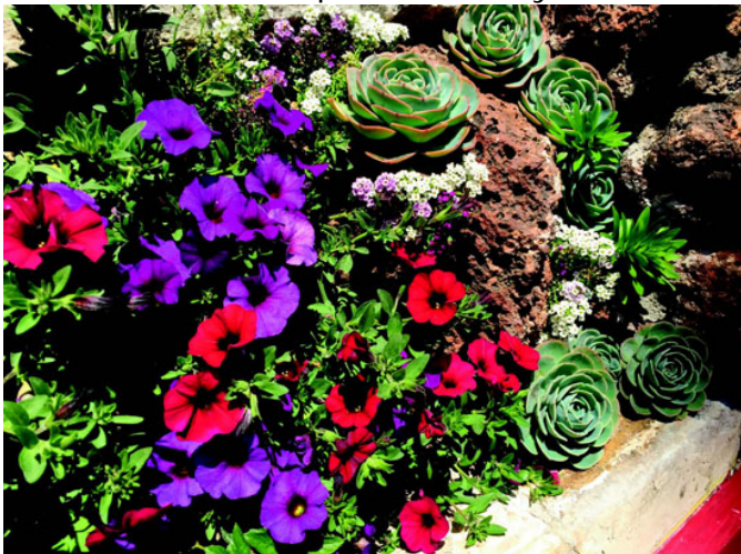
Petunias and succulents are flattering together in a rock garden.