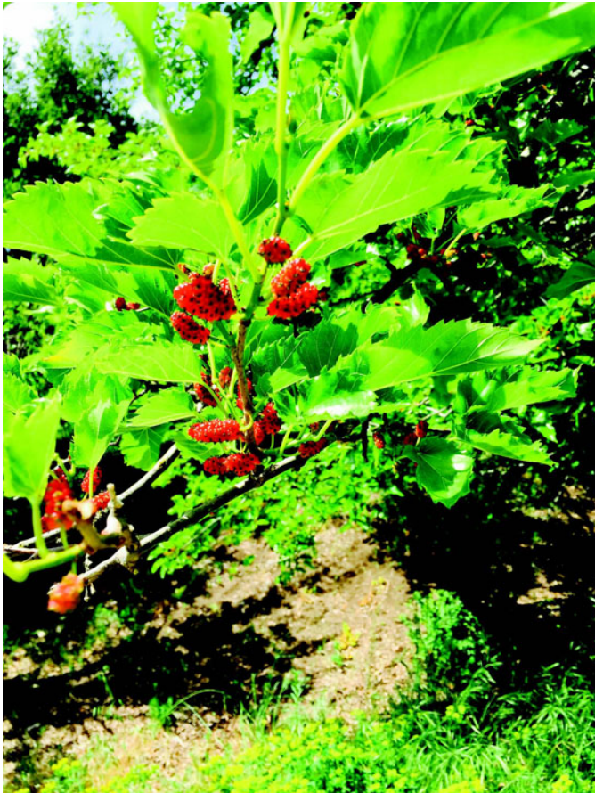
Mulberries will be ripe soon. Get your baskets ready for the harvest.