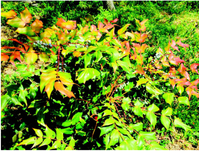
Oregon Grape is an excellent deer-proof shrub in the landscape.