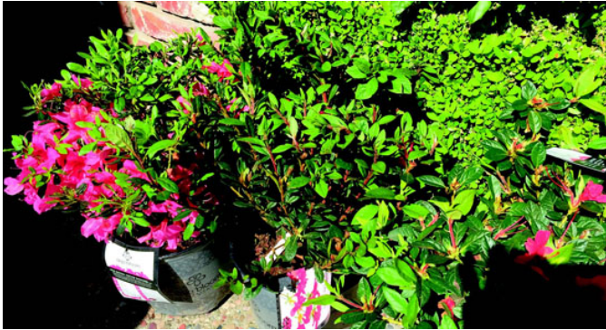
Pots of azaleas to be planted in the May garden.

Reach the reporter at: info@lamorindaweekly.com