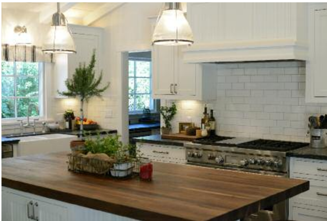
The center island's butcher block-style walnut counter warms up the kitchen in the Birrell's downtown Lafayette home.