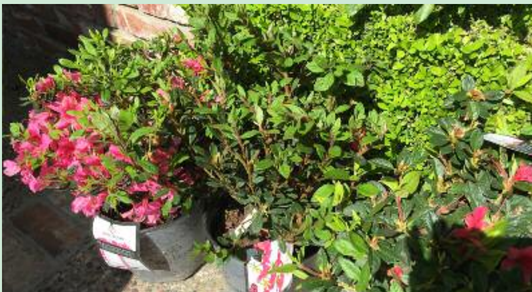
Pots of azaleas to be planted in the May garden.

ADD dandelions, calendula and lemons to your daily food intake for a boost of vitamins A and C. Colds and flu are still rampant.