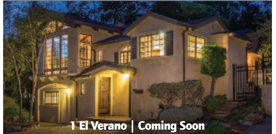
1 El Verano | Coming Soon