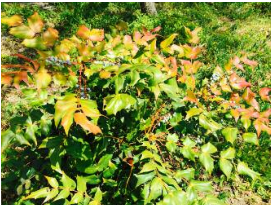
Oregon Grape is an excellent deer-proof shrub in the landscape.

The wild look of this new garden fashion will be of interest to those of us who are harried, hurried or interested in embracing a more natural, environmentally sustainable garden. Colors are whatever thrives, plantings are in drifts, maintenance is low, hardscapes are minimal, earthy-born or recycled elements, and the result is lush, overgrown and messy, yet beautiful. Seems like a great fit for these crazy, hectic times.