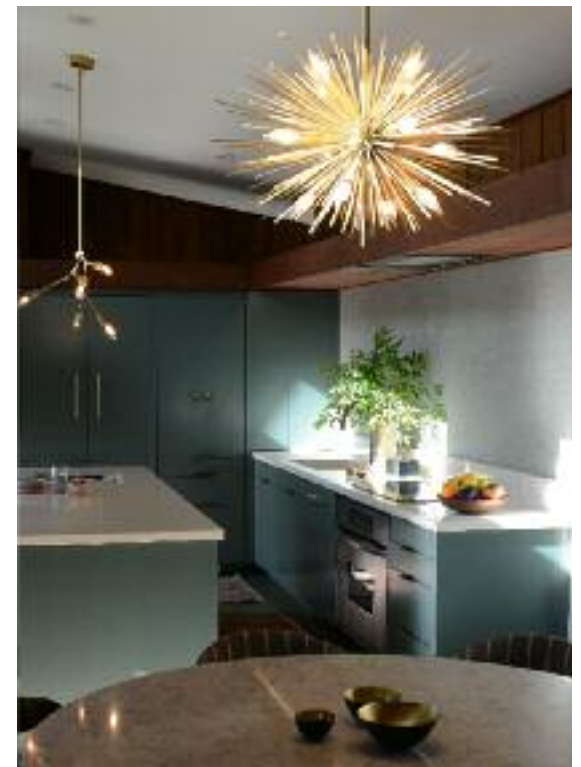
Debra Szidon's mid-century modern kitchen in Lafayette was recently featured as a "Kitchen of the Week" on Houzz.com.