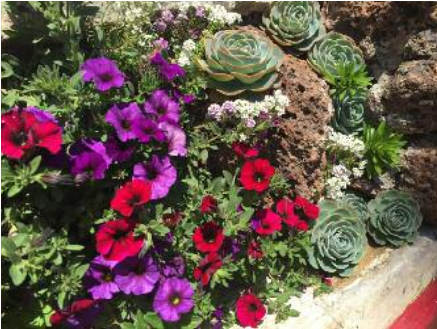
Petunias and succulents are flattering together in a rock garden.