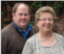
THE CHURCHILL TEAM