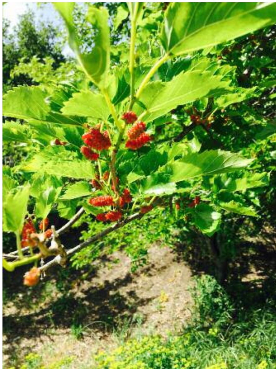
Mulberries will be ripe soon. Get your baskets ready for the harvest.

May! What a glorious month, perhaps the most fragrant feast for our senses of the entire year. With only one evening of April rain, nature blossomed into May magnificence lavishing the landscape with color, texture, birdsong, and a painter's palette of picturesque pleasures. Elegant and dainty bearded iris spread their alluring colors and intoxicating scents along driveways and paths. Azaleas and rhododendrons sparkle in the moonlight. Now is the time to experiment with new plants to lift our zapped spirits to new heights. If you like azaleas as I do, this is the time to get them into the ground after they have completed their spring flowering.